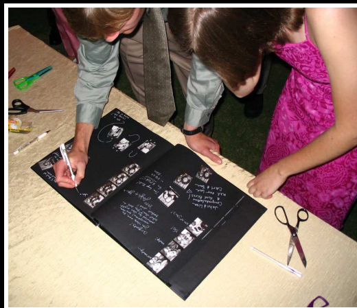
Photo Guest Book

At the end of the event we will present you with a DVD of all of the photos taken during your event.