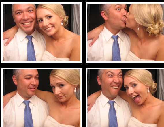
Photo Booth Package

One of the best things about having a photo booth at your events is the pictures you get to keep when its over. We can help you create a photo guest book with pictures and messages from all of your guests. This will become a treasured keepsake for years to come. The photo guest book is normally a $75 add on to your package. But when You book your photo booth before April 30th, we will add it on for free!!