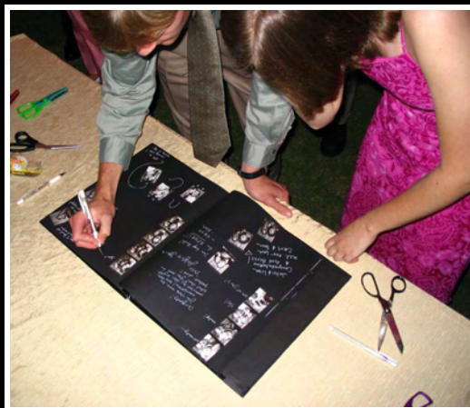
Photo Guest Book

At the end of the event we will present you with a DVD of all of the photos taken during your event.