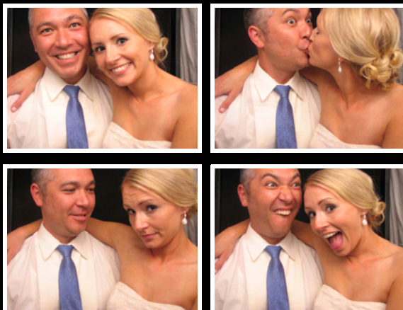
Photo Booth Package

One of the best things about having a photo booth at your events is the pictures you get to keep when its over. We can help you create a photo guest book with pictures and messages from all of your guests. This will become a treasured keepsake for years to come. The photo guest book is normally a $75 add on to your package. But when You book your photo booth before April 30th, we will add it on for free!!