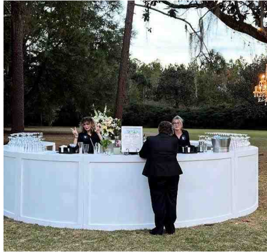
Large Circular - $950