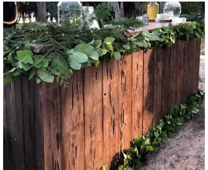
8ft. Pecky Cypress Wood - $450