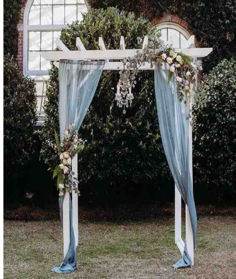
White Pergola w/hanging chandelier $350 (Draping not included)