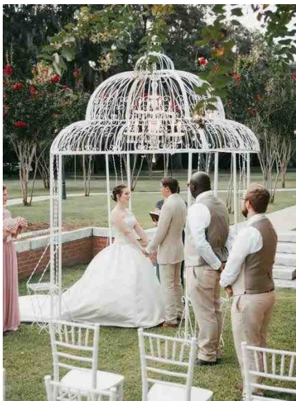
White Gazebo w/hanging chandelier $350