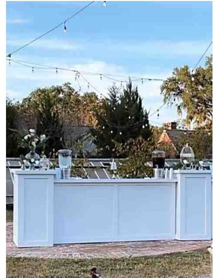
8ft. Straight with pedestal sides - $450.00 per (4 sets available)