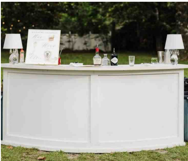
6ft. Curved - $325