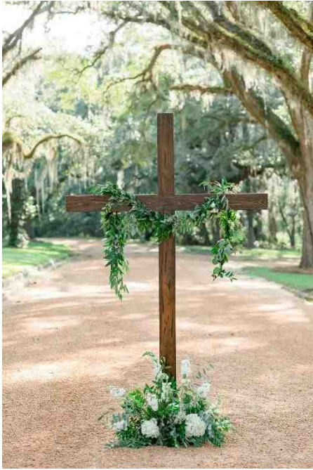
Ceremony Cross $185