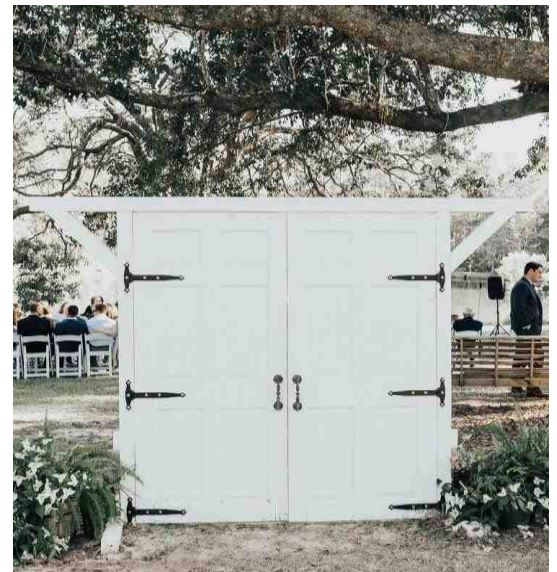
Ceremony Doors $550