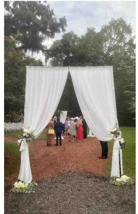
Ceremony Curtains $250 per set (Photo shows 1 set)