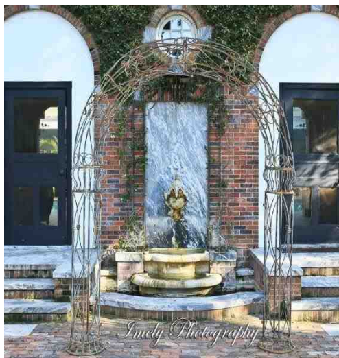
Cast Iron Arch $250