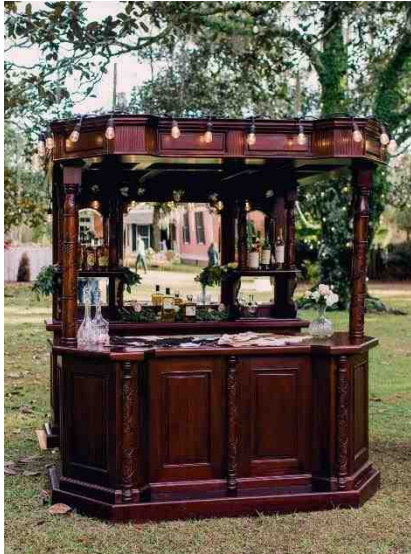
Antique - $2,400.00

Bar rental pricing does not include increase in event staff fee for bartender operations during event.