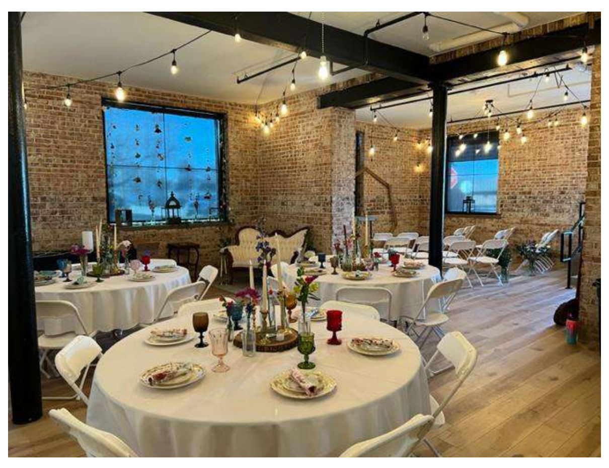
Page 7 of 8