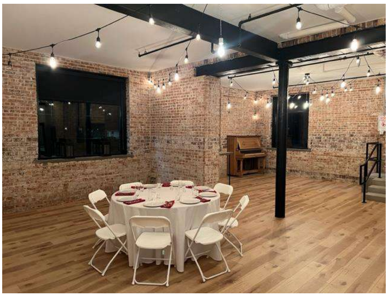
Page 3 of 8