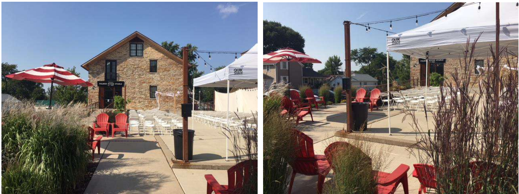
Outdoor Ceremony Seating