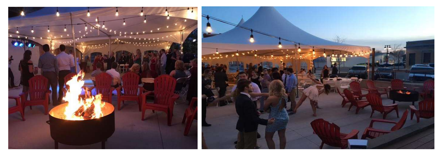
Front terrace and a Bonfire we will build, light, stoke and manage.