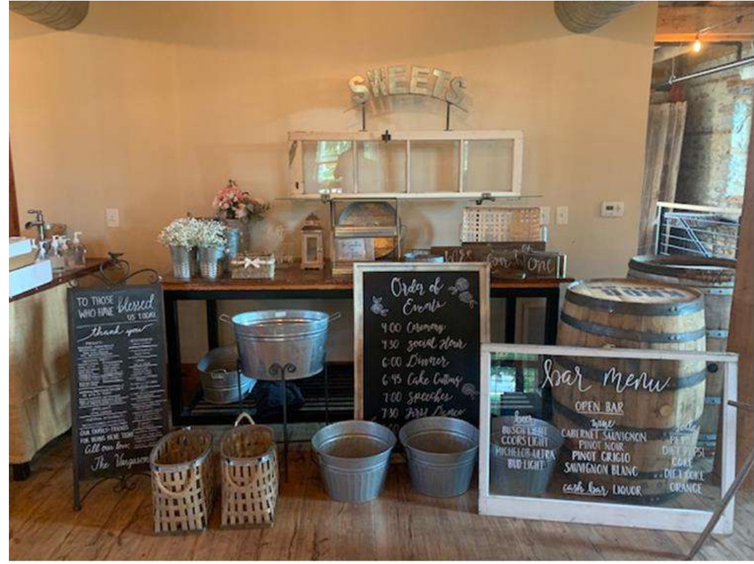
Our Latest Complimentary Decorating Accessories