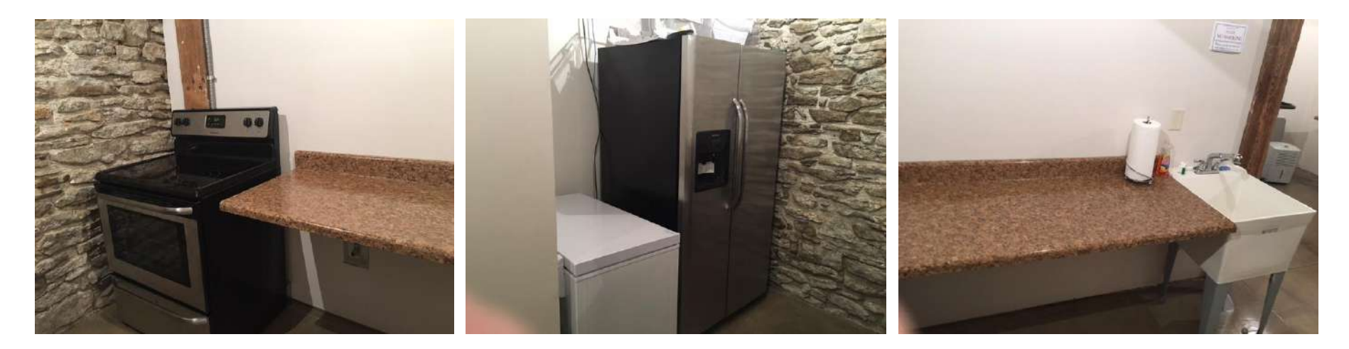
Prep Kitchen-Oven range-freezer-refrigerator-counter space and tub sink.