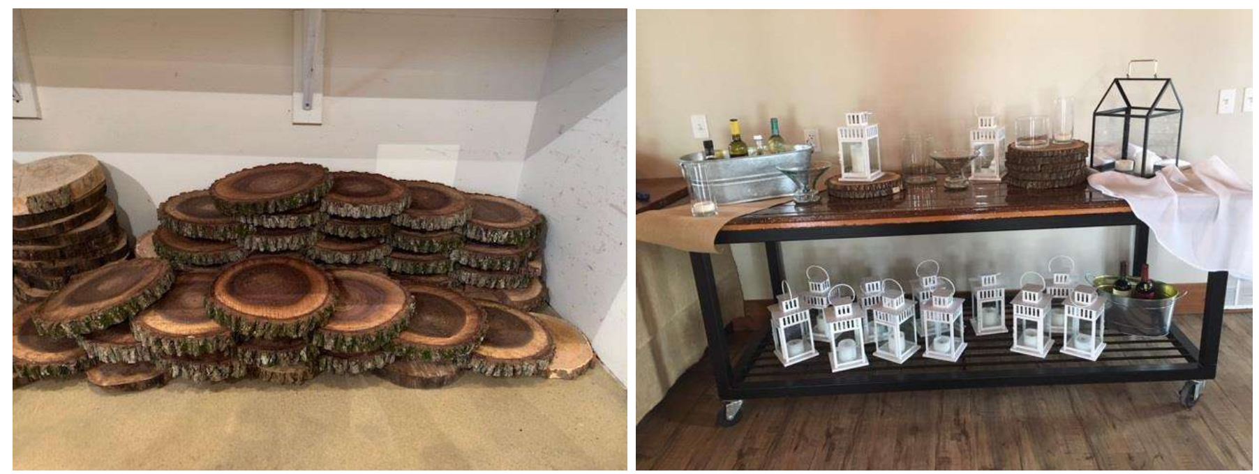
Newly cut each year live edge centerpieces