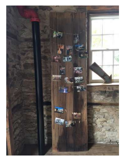
Entry barn door picture pinup