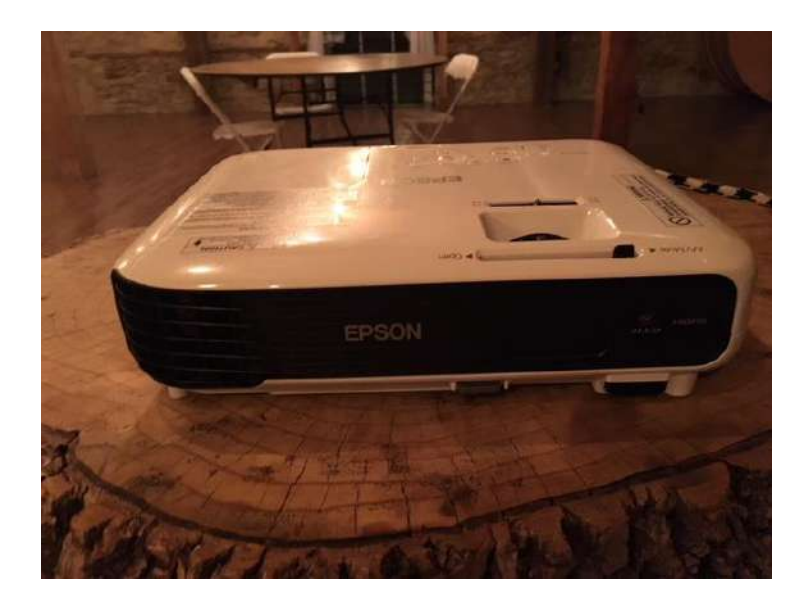
EPSON Projector and Screen

For use indoor ceremony and speeches, or outdoor on the terrace during ceremony.