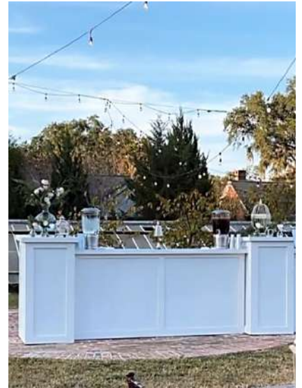
Mid-Size White w/ pedestal sides $399.00 per (4 sets available)