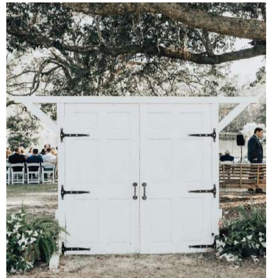
Ceremony Doors $550