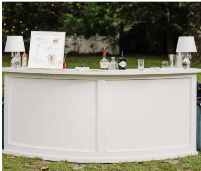
Mid-sized Curved $350