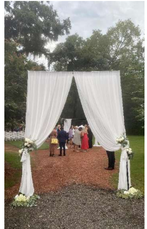
Ceremony Curtains $250 per set (Photo shows 1 set)