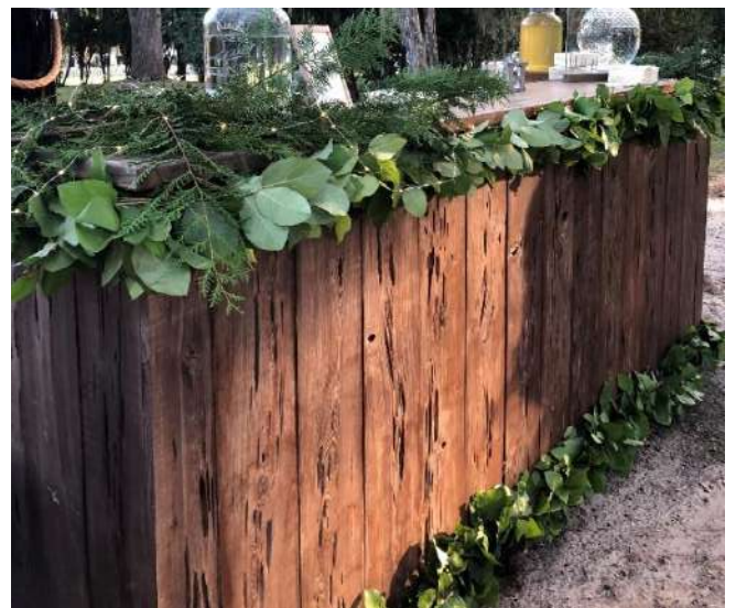
Wood Pecky Cypress $450