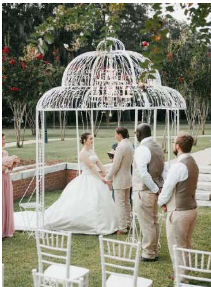
White Gazebo w/hanging chandelier $350