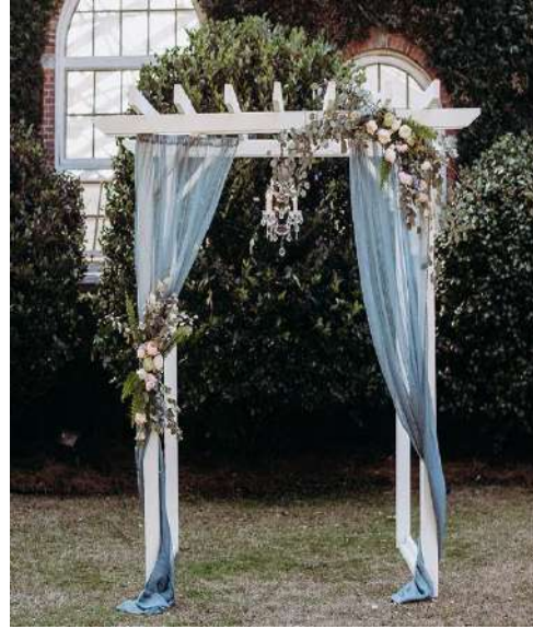
White Pergola w/hanging chandelier $350 (Draping not included)