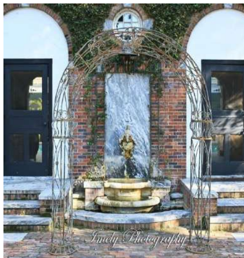
Cast Iron Arch $250