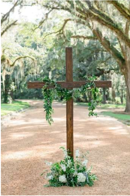
Ceremony Cross $185