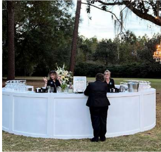
Large Circular $899