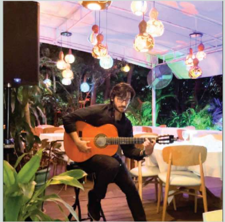
Live Guitar Performance