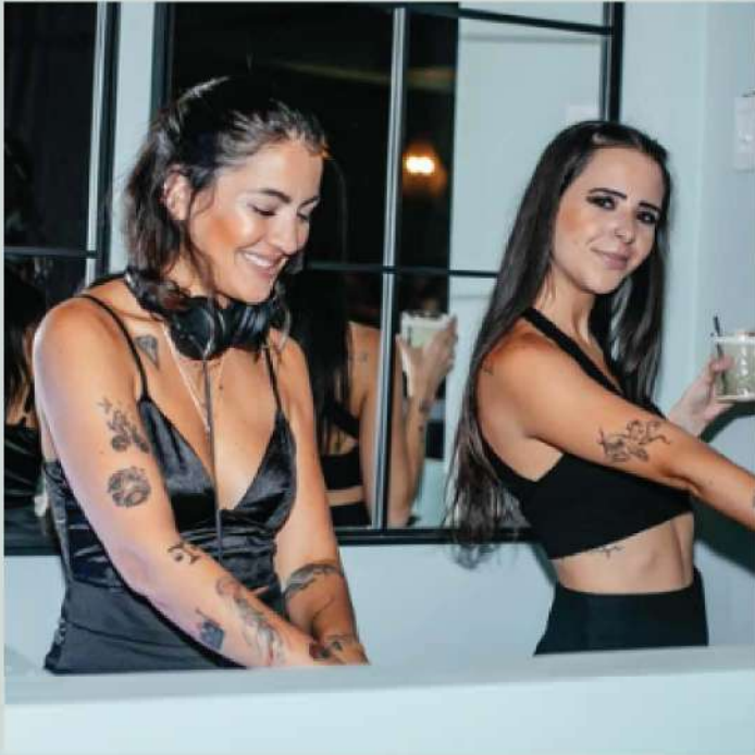
Live DJ Performance