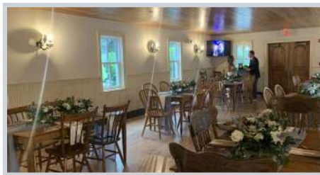
TAVERN 34 seated/45 standing