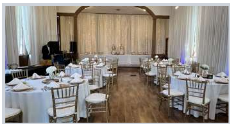
MEETING HOUSE 80 seated/90 standing