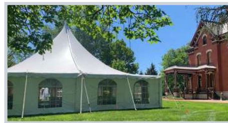
MANSION LAWN Tent by third-party vendor