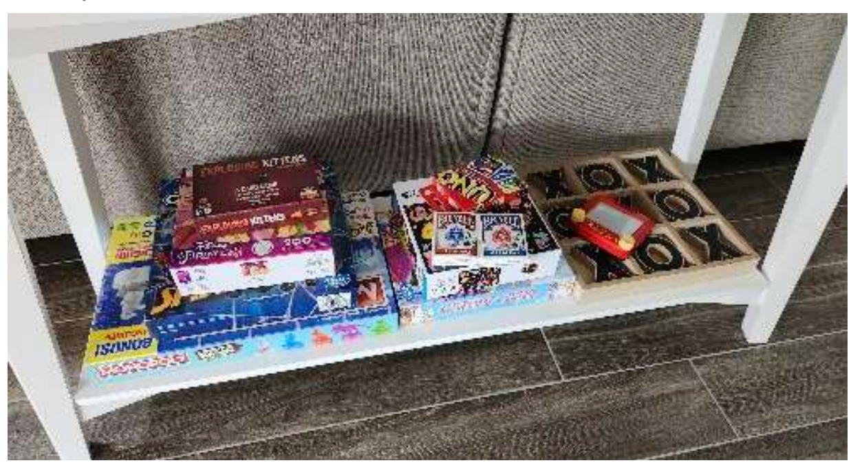
An assortment of games are available for your enjoyment. Although we do not provide you with R/C toys, remote controlled boats, planes, helicopters, etc and kites are ideal for the Lake Estate. With 13 acres to play, this is your chance to enjoy toys that require big spaces.