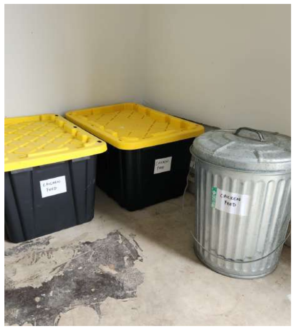
Chicken feed located in garage