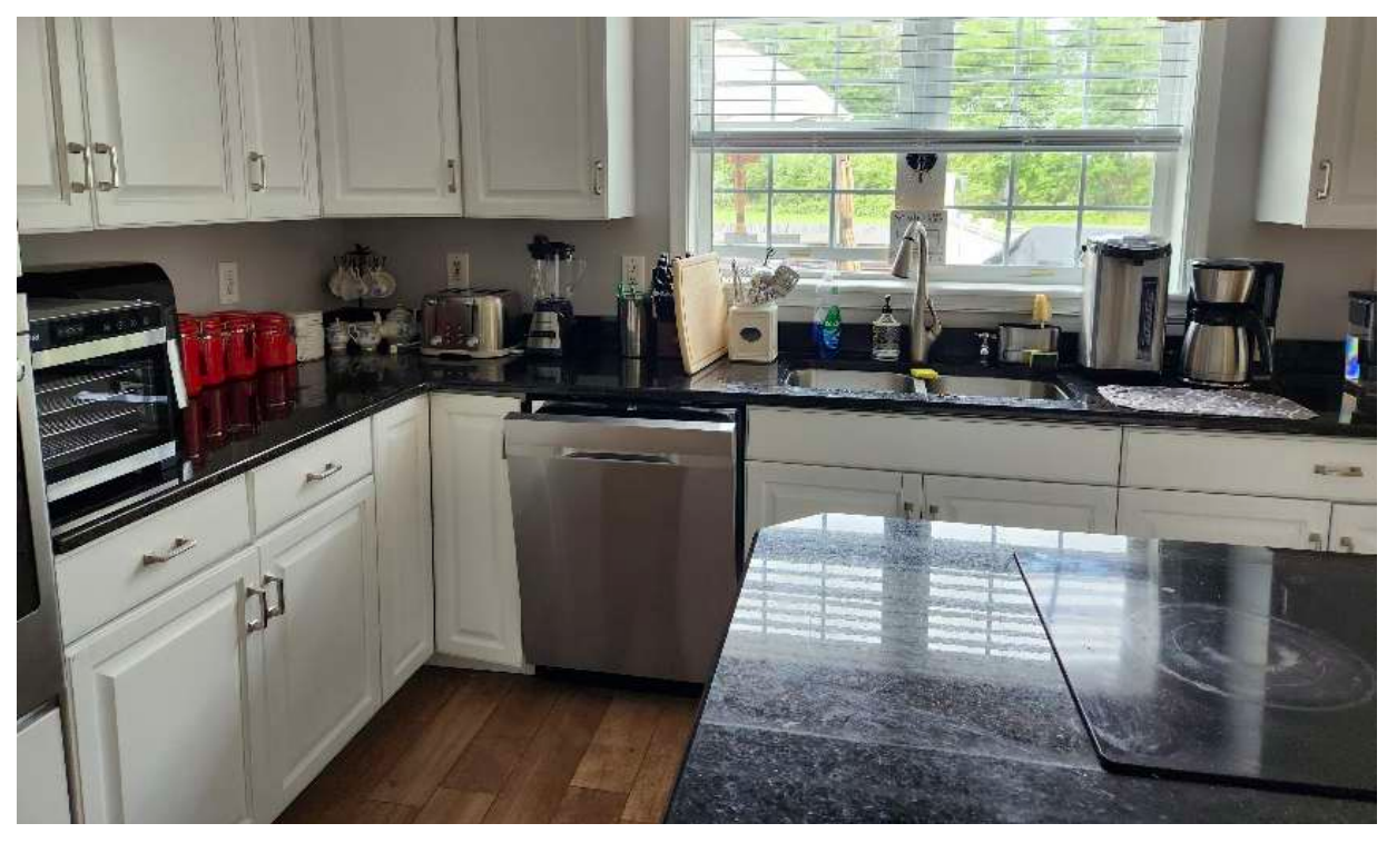
From blender to extra-large bread toaster, the Lake Estate's kitchen has everything you need to prepare a meal quickly. Extra-large party serving plates and enough mugs and drinking glasses for 50+ people are provided in case you need them.