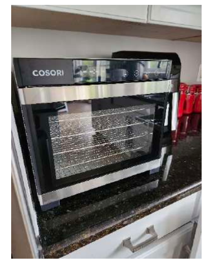
The dehydrator is for making dried food (beef jerky, salmon jerky, dried apple chips, banana chips, etc). For desired recipes, search Youtube videos.