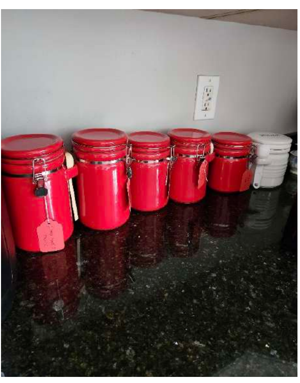
We provide you with the basics needed for cooking and more! Enjoy the complimentary teas and coffee in the red vacuum sealed canisters.