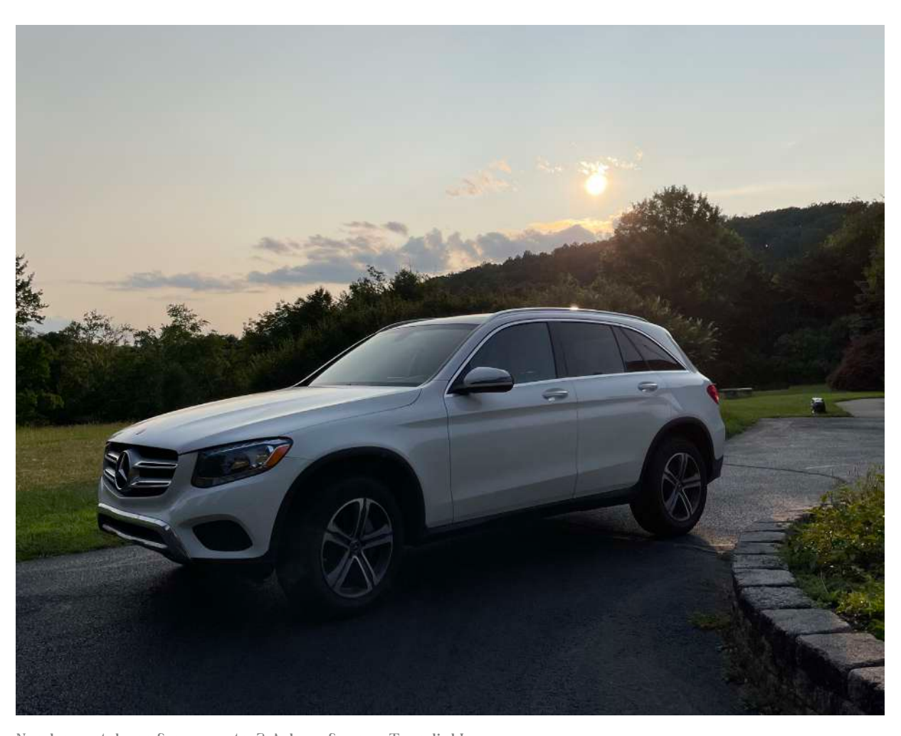
Need a rental car for your stay? Ask us for our Turo link!