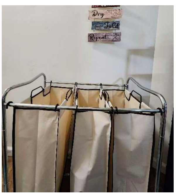
Place all dirty linens and towels in this laundry hamper.