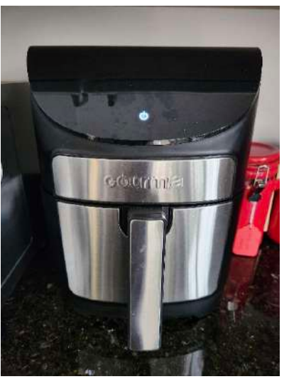
Be careful if you select "Air Fry" mode. Most food will burn quickly so start with just 2-3 minutes of frying time until you become familiar with this appliance.