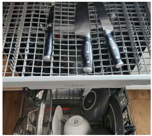
Put knives on the top tray of the dishwasher to avoid cuts. The dishwasher is good for rinsing your dishes, but not good for washing your dishes. Please make sure the base of the dishwasher is not clogged with food particles.