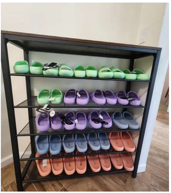
Please do not wear your shoes inside the house. Comfortable slippers are provided for you while you walk around inside the house. Do not wear the slippers outside except the front patio and back patio.