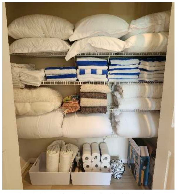
The Supply Closet located on the 2nd floor has everything you need for a comfortable stay. Please take what you need.