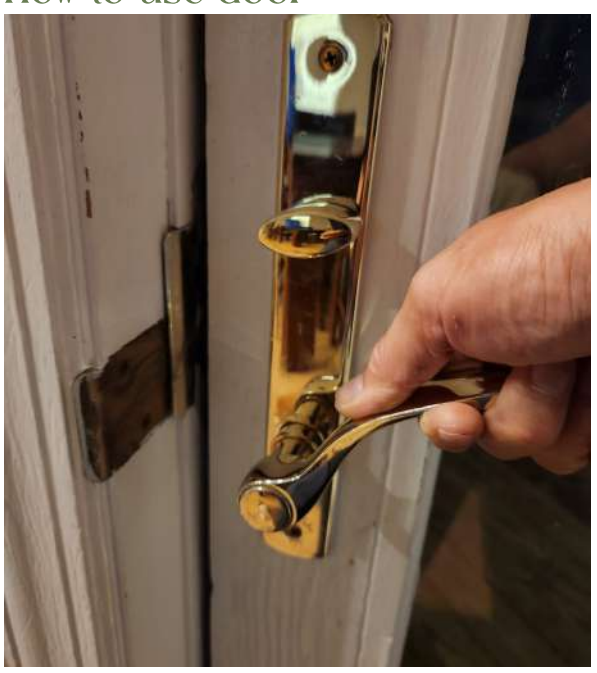
Lift the handle up and turn lock!