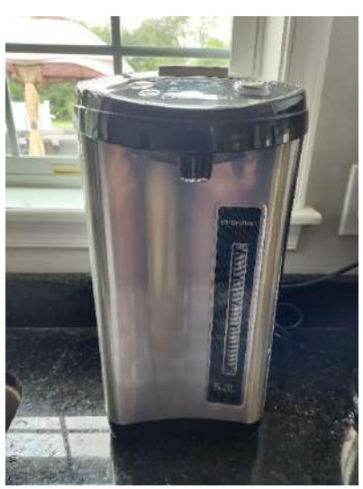
The on-demand hot water dispenser makes hot drinks effortless and without the need to boil a kettle of water. Please refill with water so the inside does not become dry and overheat.