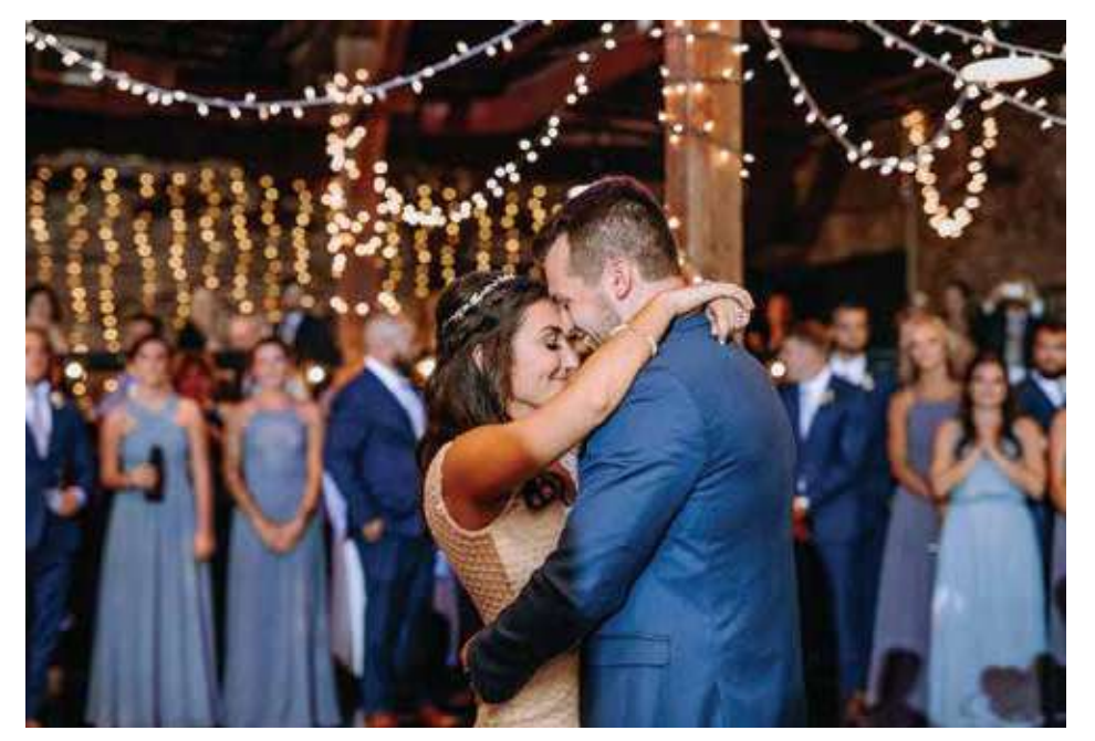
Cocktail style for up to 200 guests Reception seating with dance floor for up to 130 guests