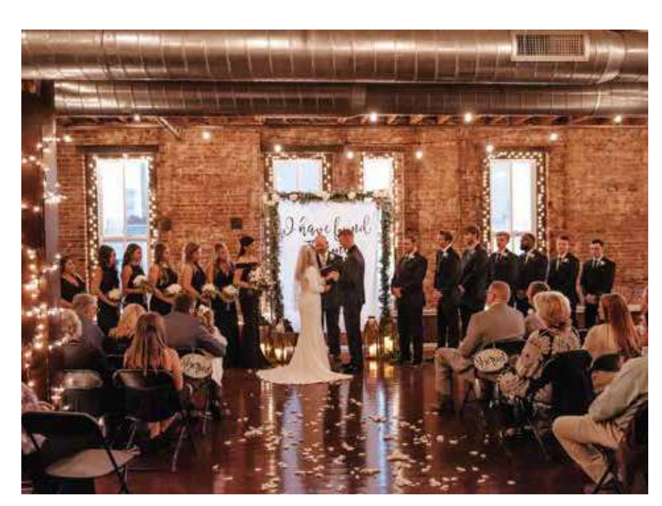
Ceremony-style seating or cocktail-style for up to 250 guests Reception seating with dance floor for up to 180 guests