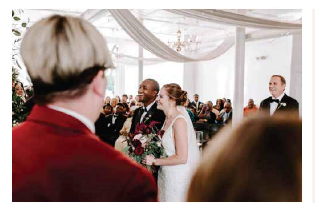
Ceremony-style seating or cocktail-style for up to 250 guests Reception seating with dance floor for up to 170 guests