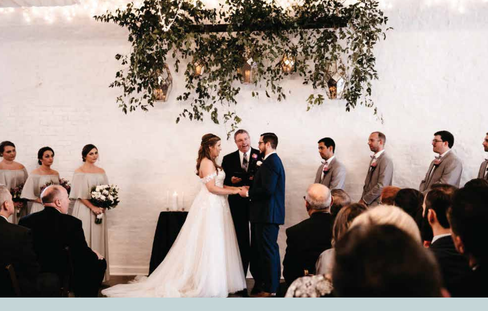
TAKE A VIRTUAL VENUE TOUR ON OUR WEBSITE: BALINESEBALLROOM.COM/INFO