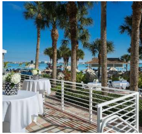
CEDARWOOD TERRACE RECEPTION