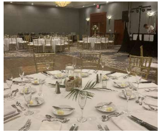
SAND KEY BALLROOM