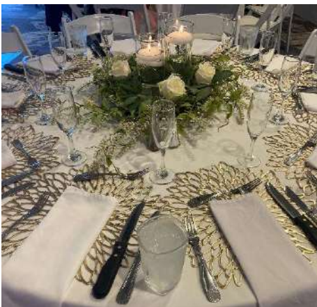
TABLE SETTING BY VENDOR