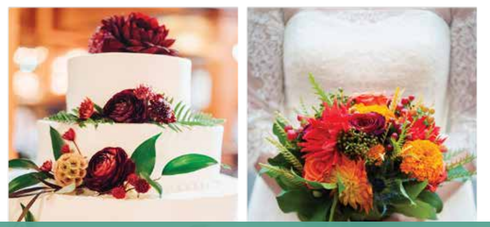
Fresh, local floral selection is part of your planning process once you book with us. From pre-built floral packages to custom arrangements, let us take care of the details.