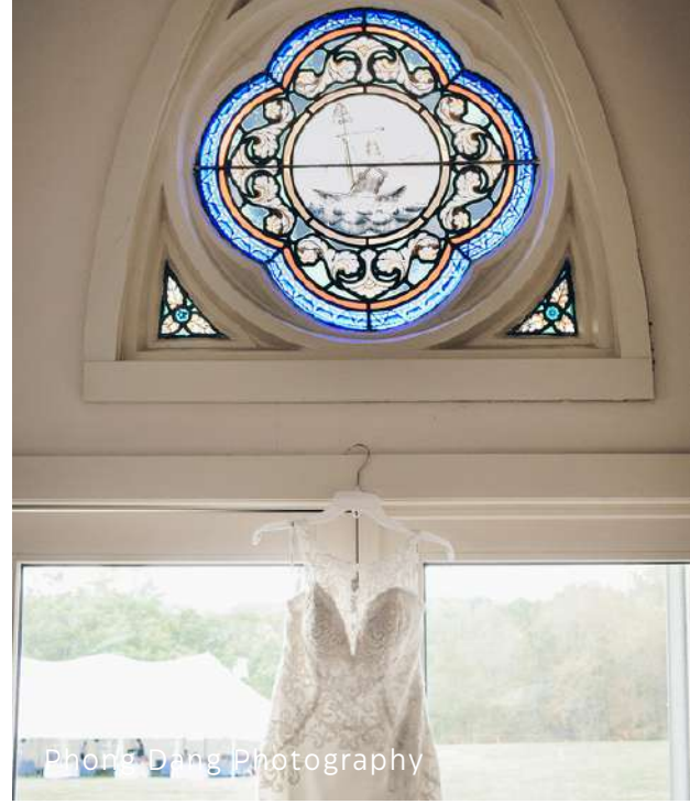
Phong Dang Photography