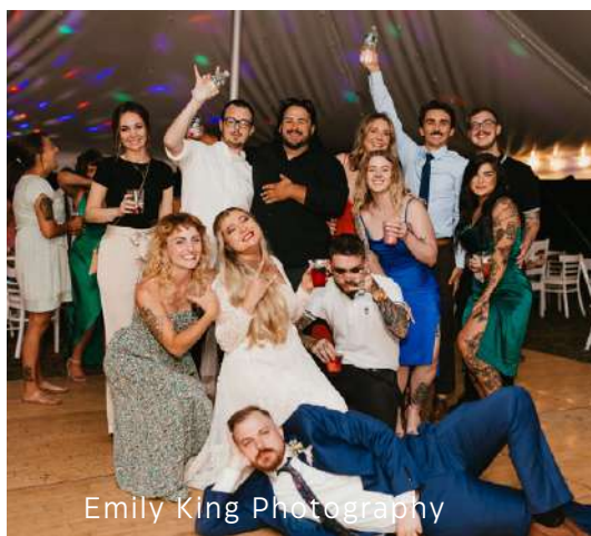
Emily King Photography