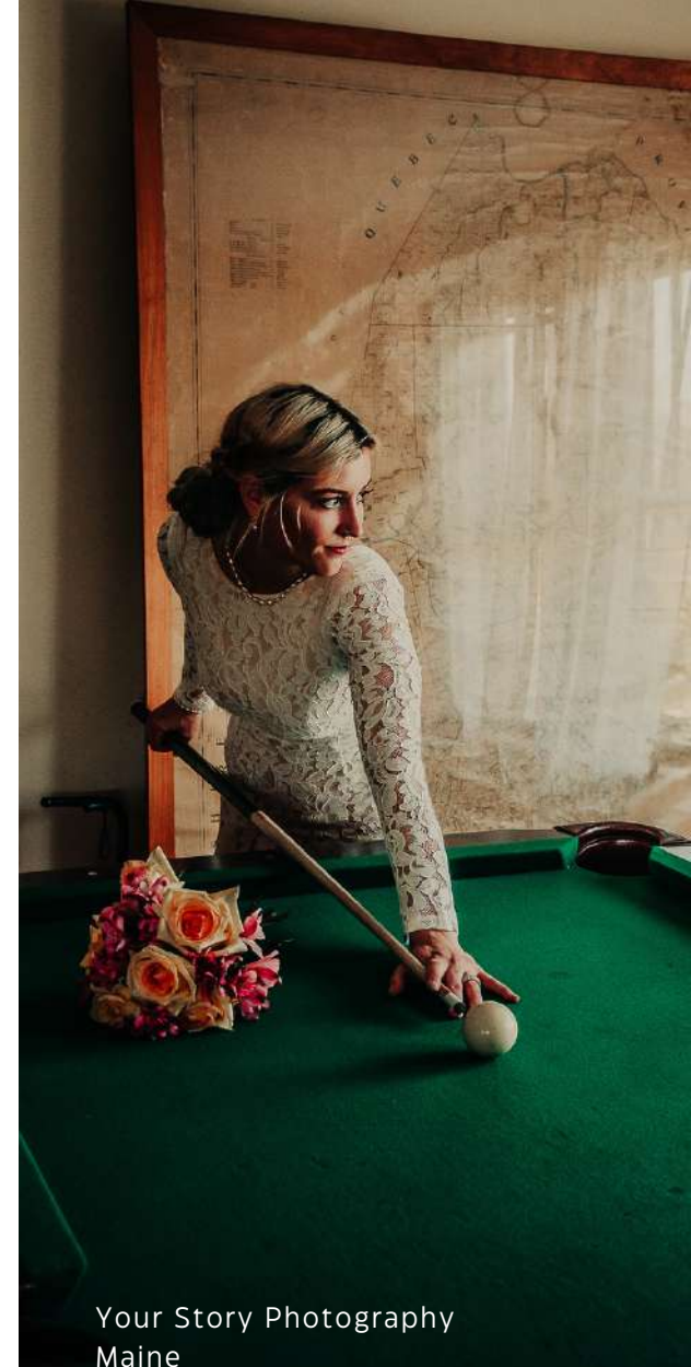
Your Story Photography Maine