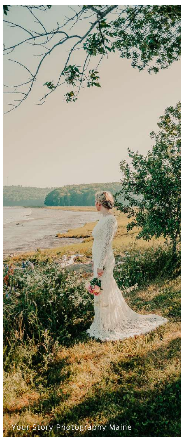
Your Story Photography Maine