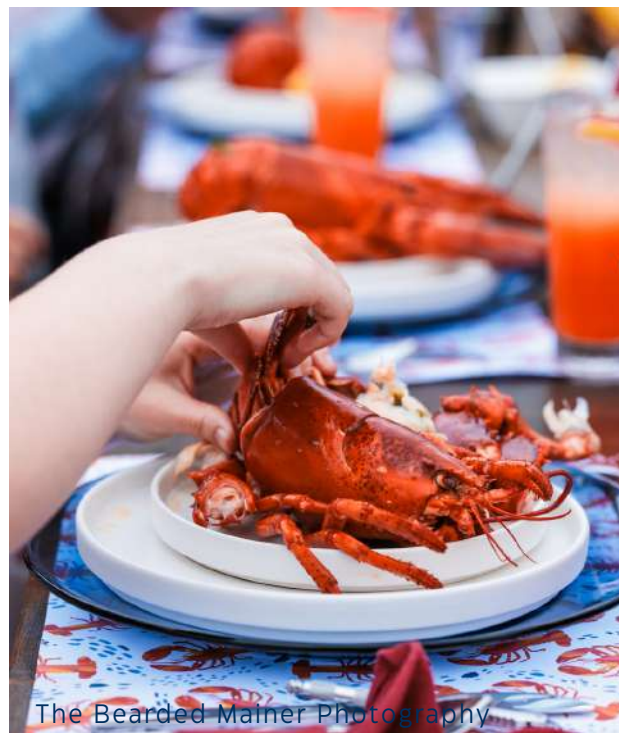
The Bearded Maliner Photography