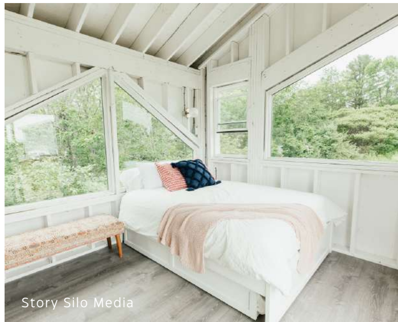
Story Silo Media