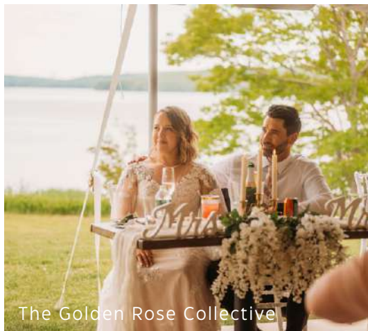
The Golden Rose Collective