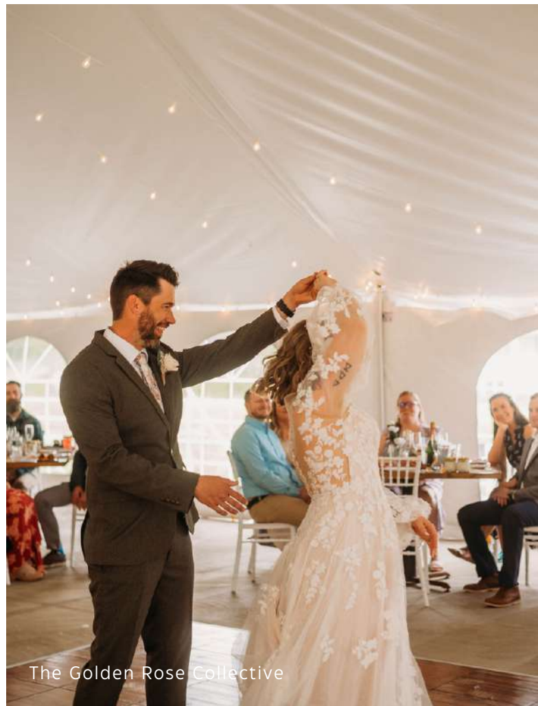
The Golden Rose Collective