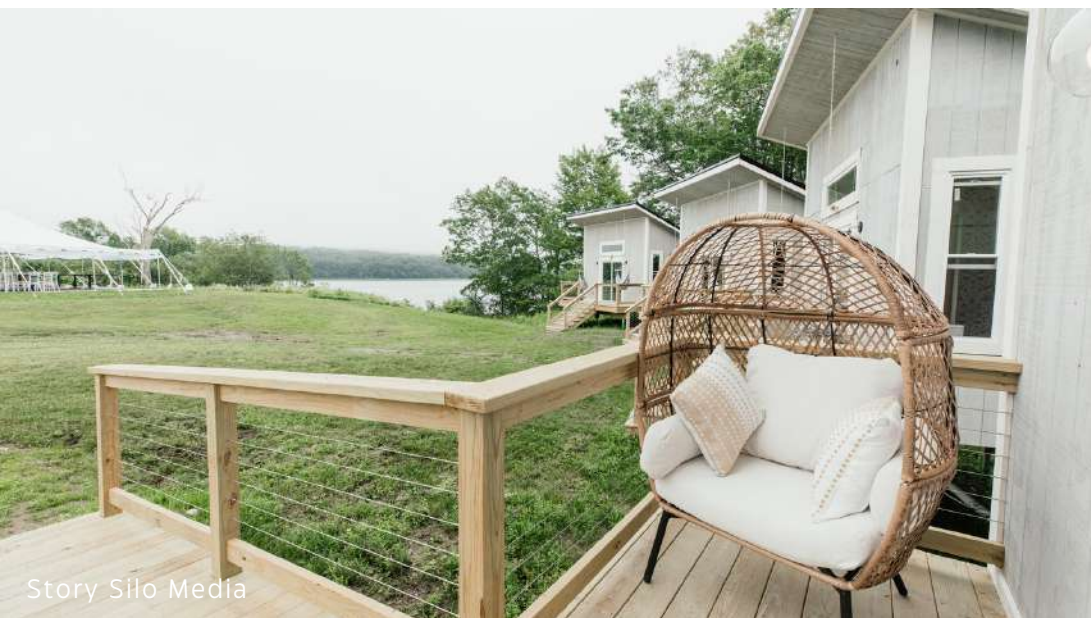
Story Silo Media