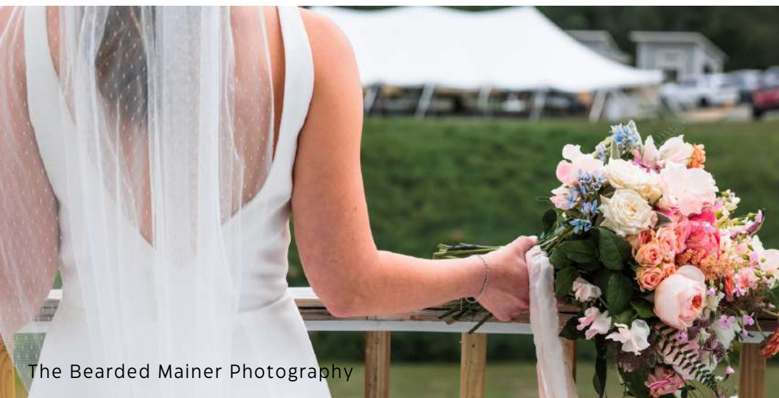
The Bearded Mainer Photography