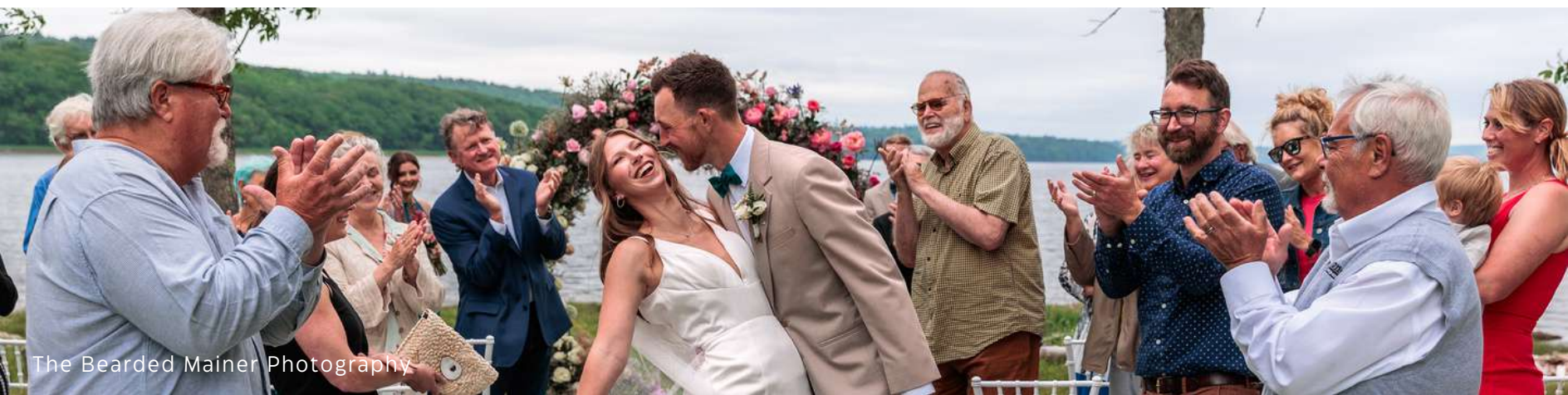
The Bearded Mainer Photography