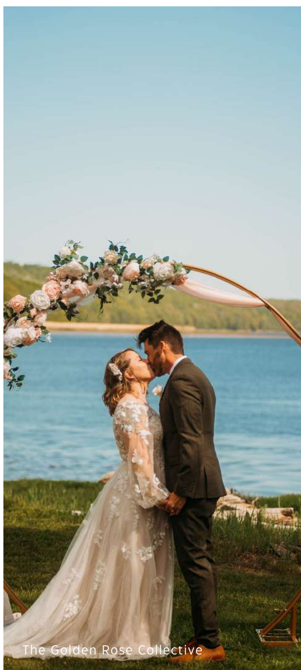
The Golden Rose Collective