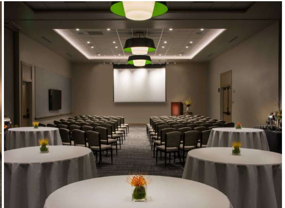
Silver Creek Room