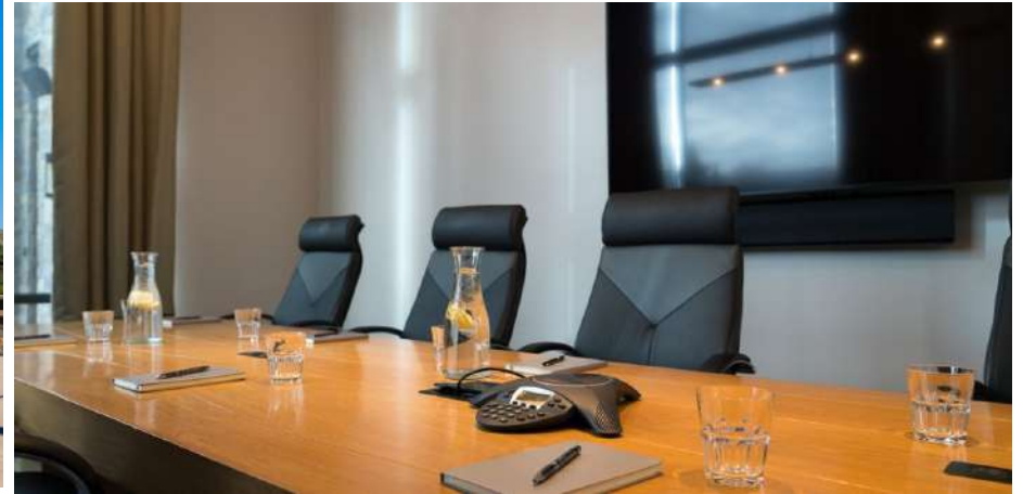
Guyer Springs Boardroom

Limelight features over 12,000 square feet of flexible, unique event space from patios with breathtaking views to tasteful indoor spaces featuring ample natural light. Our high-speed wireless internet access & state-of-the-art audio visual services ensure you and your guests stay connected & capture every moment.