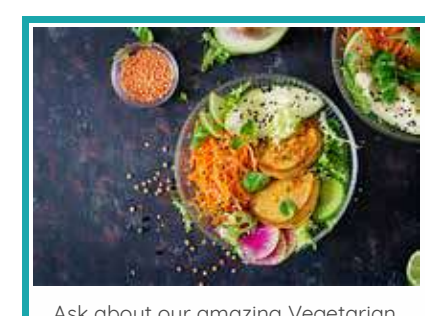
Ask about our amazing Vegetarian, Vegan, and Pescatarian options.