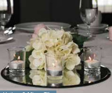
Votives & Mirror Tile

Mix, match and embellish with florals to customize your look.