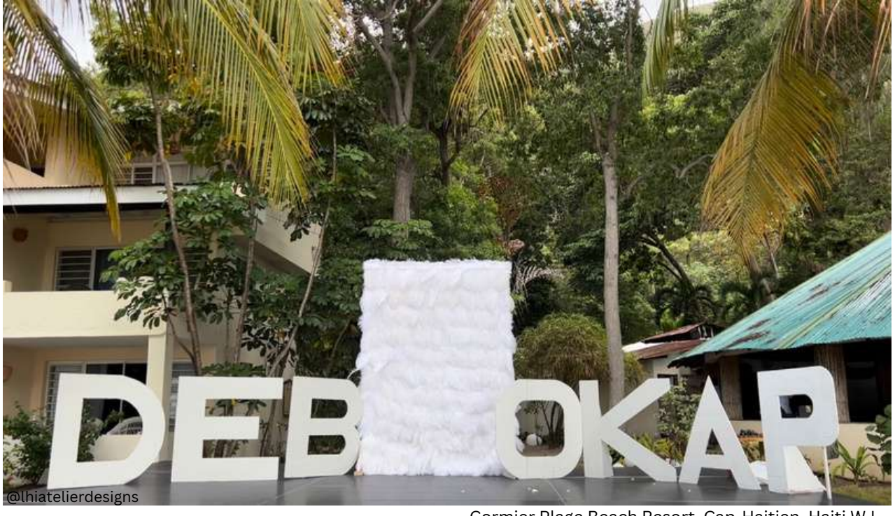
Cormier Plage Beach Resort, Cap-Haitien, Haiti W.I

During this project, Lhia'Telier Designs had the opportunity to make new connections and memories with local business owners and young entrepreneurs of Cap-Haitien.