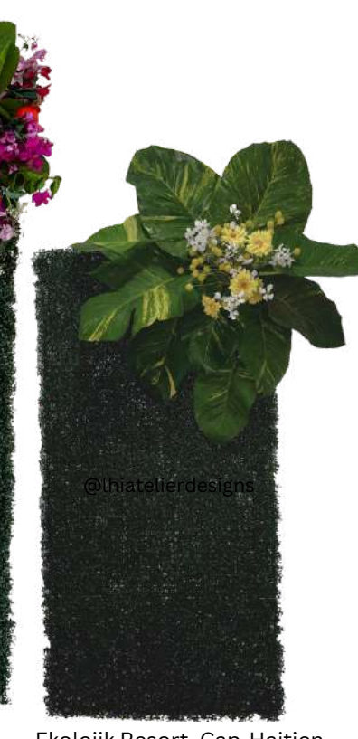
Ekolojik Resort, Cap-Haitien