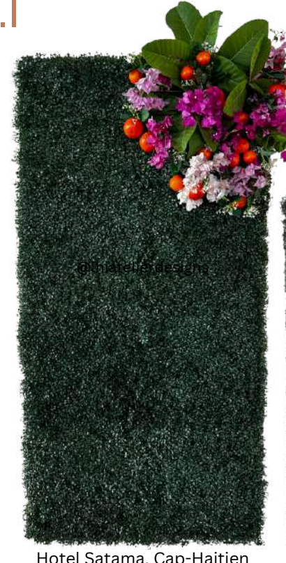
Hotel Satama, Cap-Haitien