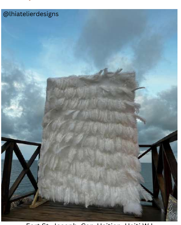
Fort St. Joseph, Cap-Haitien, Haiti W.I