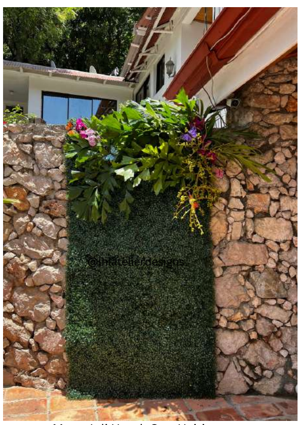
Mont Joli Hotel, Cap-Haitien