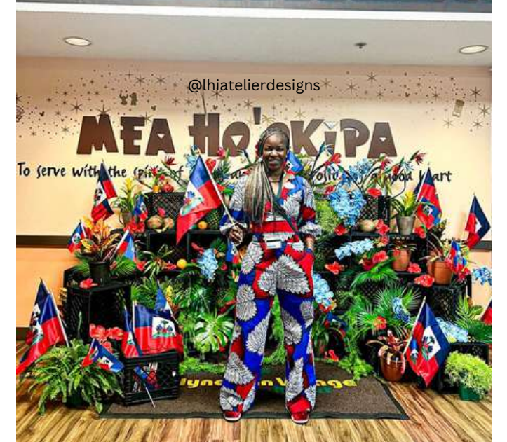
Walt Disney World, Polynesian Village Resort

"We are more alike than we are unalike"- Maya Angelou