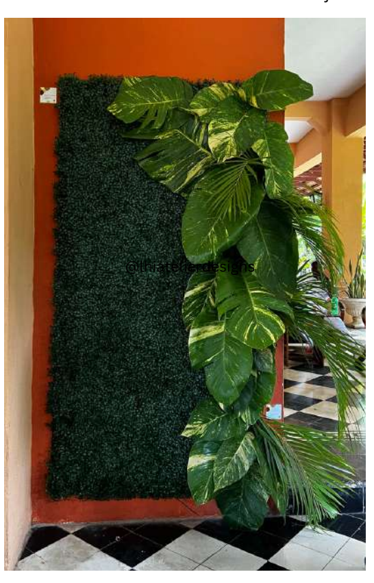
Hôtel Roi Christophe, Cap-Haitien