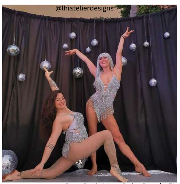
Post Park, West Palm Beach, FL