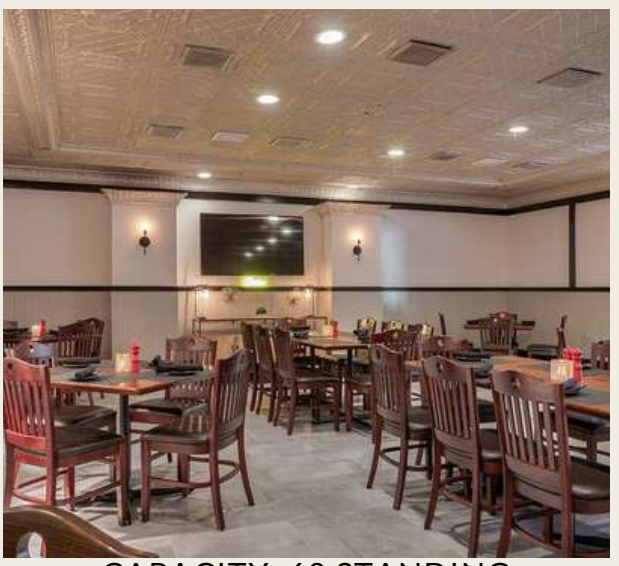
CAPACITY: 60 STANDING 45 SEATED