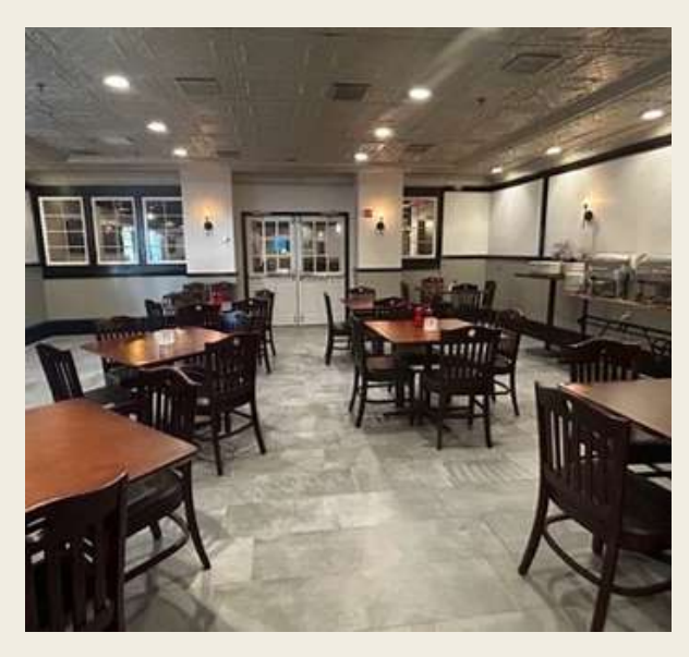
LONG BRIDGE BACK VIEW CAPACITY: 60 STANDING 45 SEATED