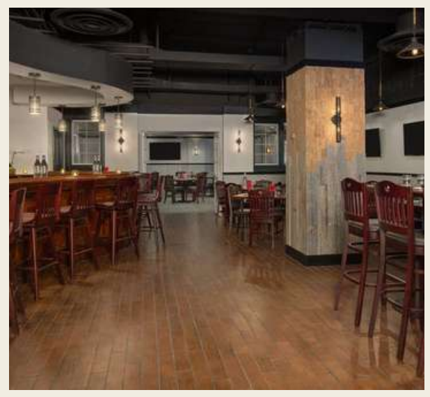
CAPACITY: 70 STANDING 70 SEATED