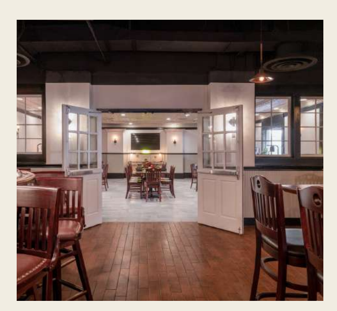
LONG BRIDGE ENTRANCE CAPACITY: 60 STANDING 45 SEATED