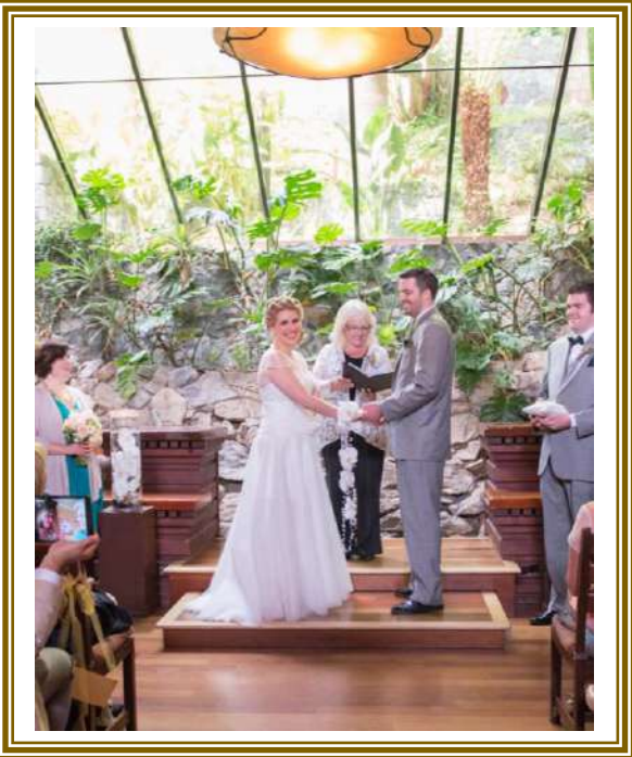
→ Rock Room Lounge available for a Monday -Thursday in the months of November – May ONLY 11am-5pm only ← The Rock Room Lounge (Left) serves as our indoor location. Its beautiful rock wall and large bay windows look up at the garden terrace. There is seating for 60 guests and standing room for the remaining guests for up to 100. This room is not available for evening weddings.