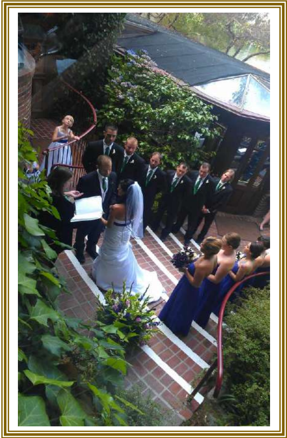
Our Creekside Patio (right) sits right alongside the Soquel Creek and can hold up to 100 guests for a ceremony (8 chairs available for seating).