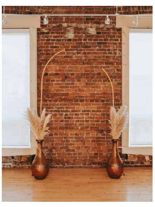
GOLDEN ARCHES $100 WITHOUT PAMPAS VASES $150 WITH PAMPAS VASES