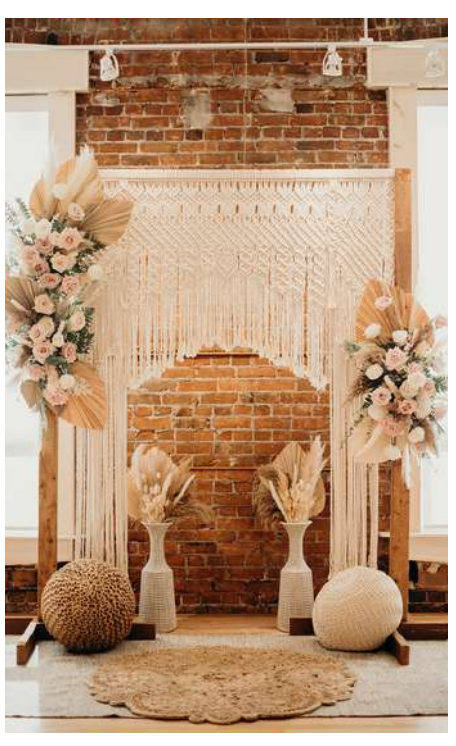
MACRAME BACKDROP $150 NOT INCLUDING FLORAL