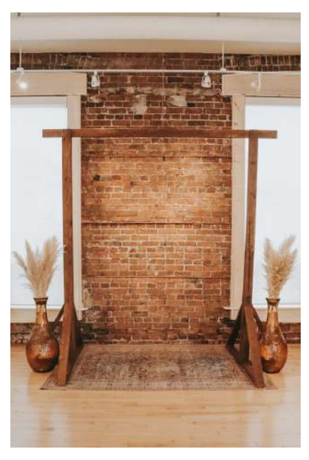
WOOD FRAME ARCHWAY $175 WITH PAMPAS VASES + AREA RUG