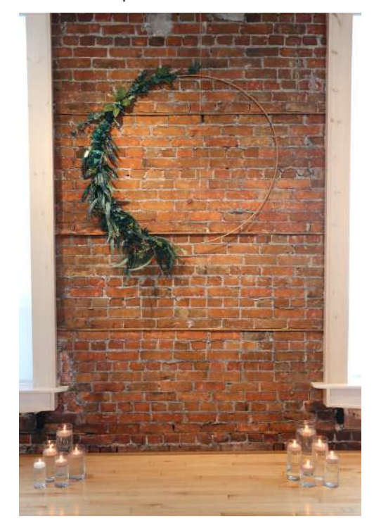
HOOP BACKDROP $75 INCLUDES GREENERY