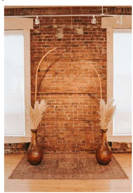
GOLDEN ARCHES $175 WITH PAMPAS VASES + AREA RUG