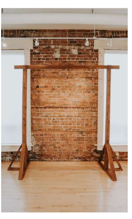
WOOD FRAME ARCHWAY $100 ADD YOUR OWN FLORAL