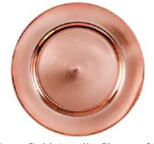
Rose Gold Acrylic Charger $3