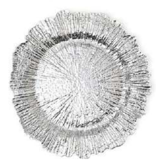
Glass Silver Coral Reef $6*