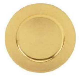
Gold Acrylic Charger $3