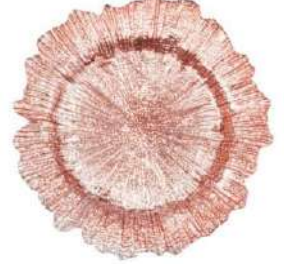
Glass Rose Gold / Blush Coral Reef $6*