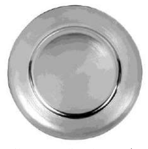
Silver Acrylic Charger $3