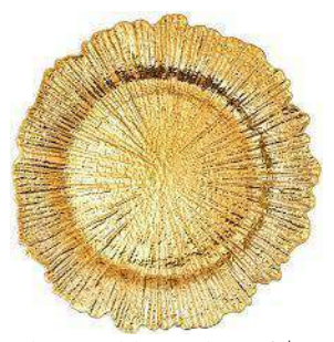
Glass Gold Coral Reef $6*