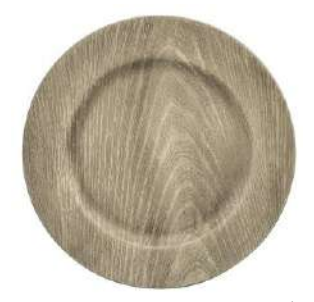
Gray Faux Wood Charger $3