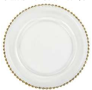
Glass Beaded (Silver, Gold and Rose Gold) $6*