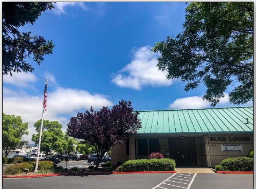
Front entrance and off-street parking