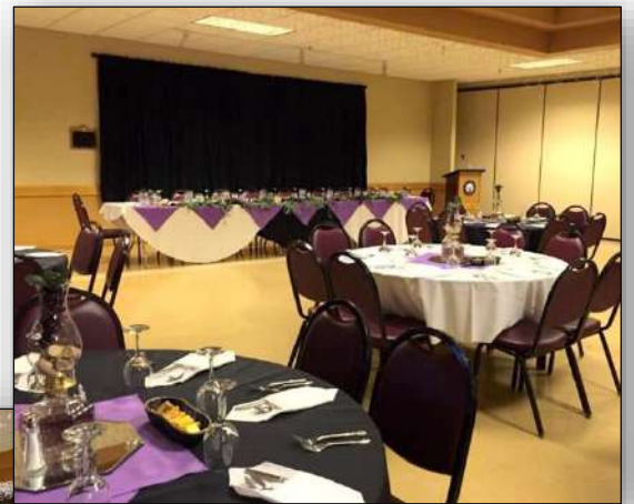
Rooms 1 & 2