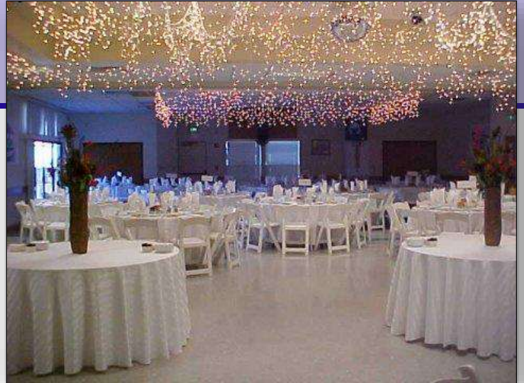
Room 2 and 3 decorated for a wedding