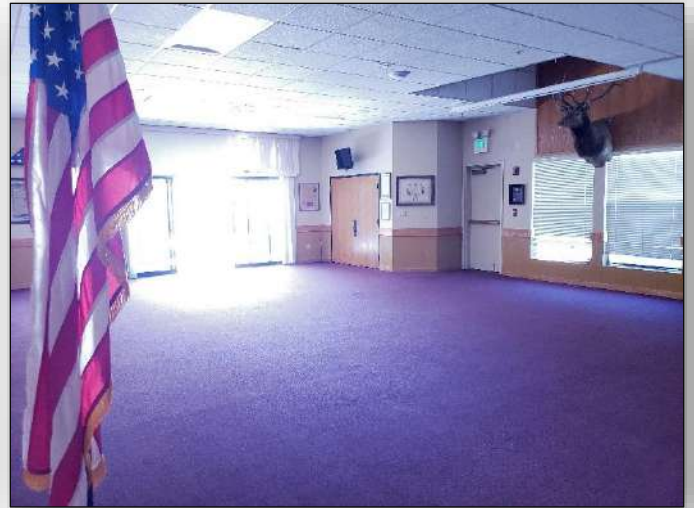
Room 3 with afternoon light from Patio area

This carpeted back room has windows for natural light, and works well for presentations, business meetings, and meals for small groups. Room 3 connects directly with the Patio, and can be fully opened to combine with Room 2.