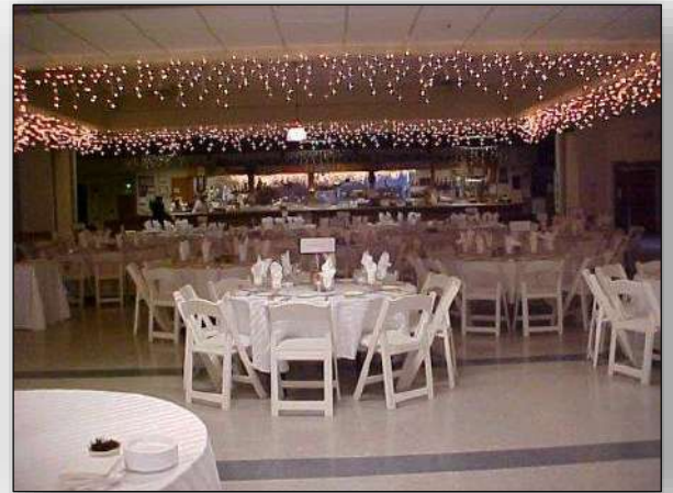
Bar/Lounge combined with Room 1