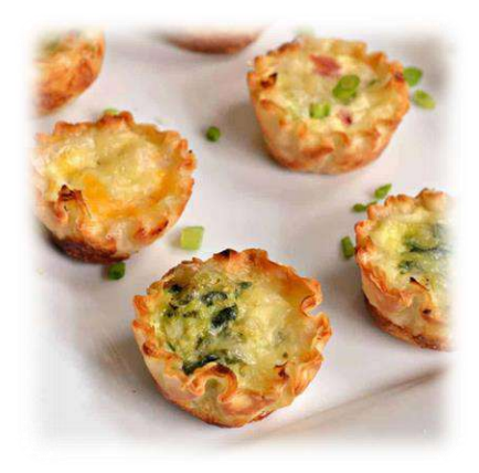
V - Vegetarian / GF - Gluten Free

Hand-Passed or Stationed; accompanied with Cocktail Sauce and Fresh Lemons