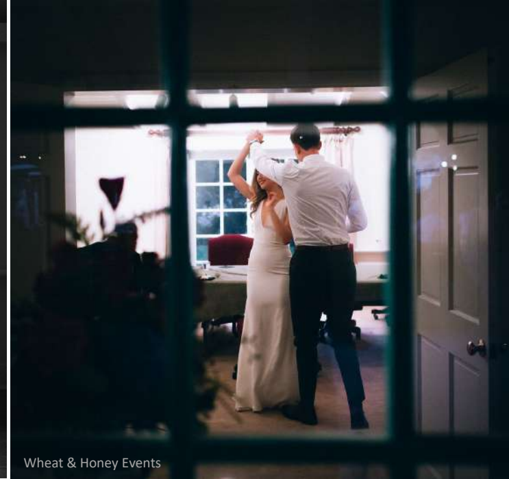
Wheat & Honey Events