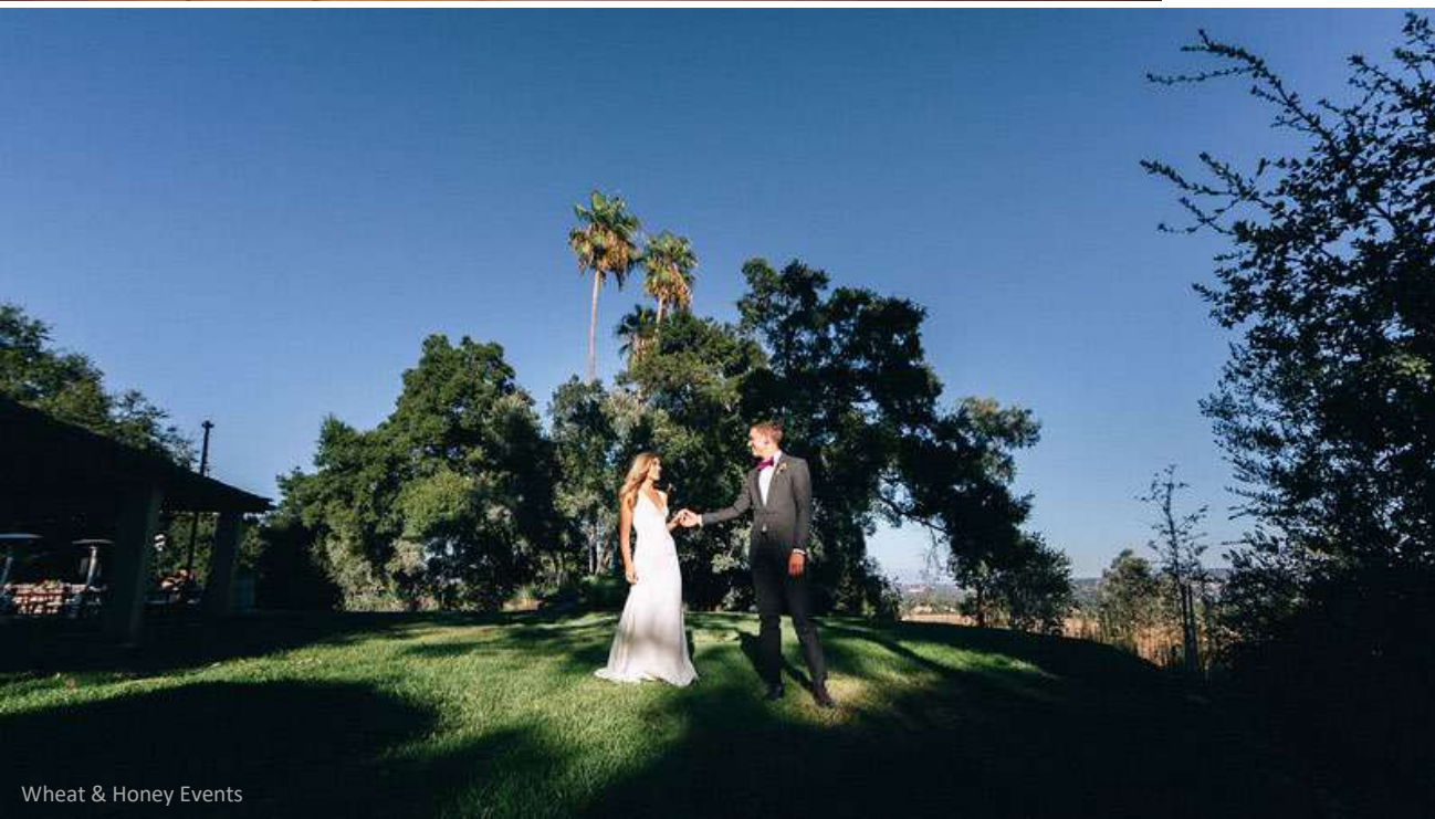
Wheat & Honey Events