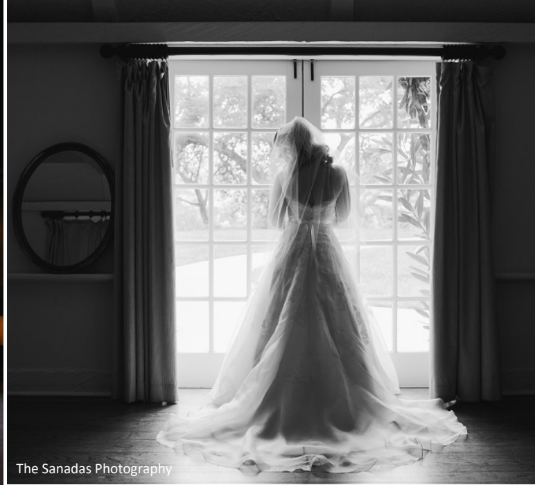
The Sanadas Photography