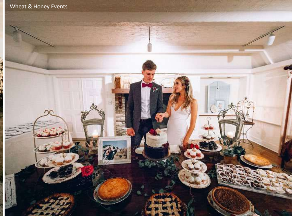
Wheat & Honey Events