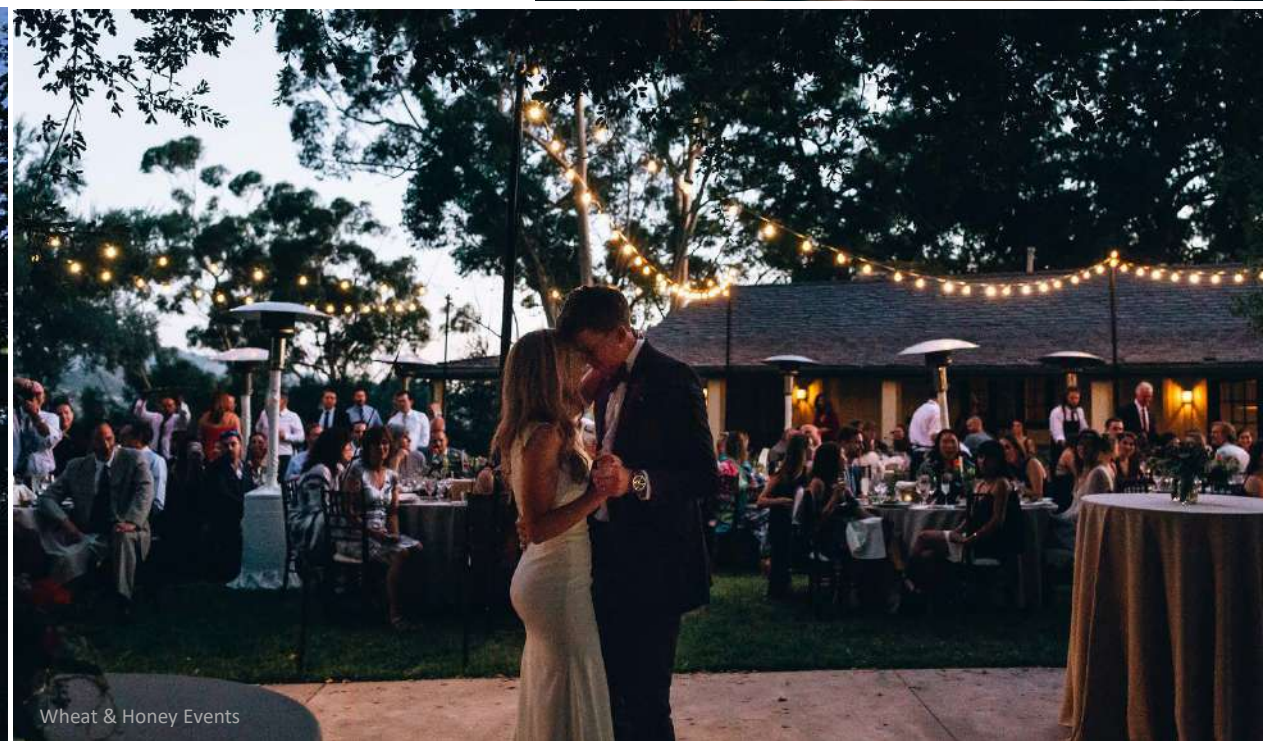
Wheat & Honey Events