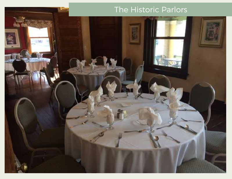
Versatile space for trade shows, meetings and intimate gatherings. Cocktail Reception up to 150 guests | Seated Reception up to 75 guests | Classroom Seating up to 25 guests | Theater Seating up to 50 guests High Speed Internet Capabilities | Off Street Parking | Handicap Accessible Located on the first floor of the hotel

Ceremony Seating up to 150 guests | Seated Reception up to 80 guests | Cocktail Reception up to 100 guests Off Street Parking | Handicap Accessible