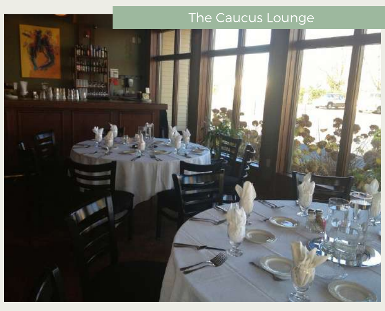
Adjacent to Conservatory, the Caucus Bar Lounge features a full built-in bar and relaxed atmosphere. Included with Conservatory Rental Cocktail Seating for up to 25 guests | Cocktail Reception up to 50 guests

High Speed Internet Capabilities | Built in Projector and Screen | Wooden Dance Floor | Dimmable Lighting | Adjacent to Caucus Lounge/ Cocktail Bar