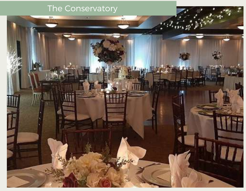
Elegant event space for weddings, banquets and meetings. 3400 square feet | 9' Ceilings | Off Street Parking | Handicap Accessible Cocktail Reception up to 350 guests | Seated Reception up to 250 guests | Theater Seating up to 300 guests

Our Event Directors will assist in creating the perfect floorplan for your event. We provide setup and teardown of tables and chairs and professional service staff will execute your event from beginning to end. White linen and complete china and glassware are provided with every event.