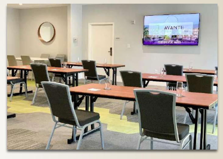
We're Here To Help Create Fun Memories & Satisfy Every Craving