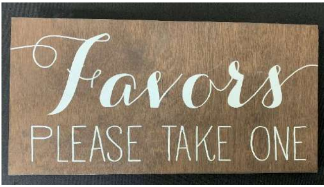
Wooden Sign with White Lettering- "Favors Please Take One."