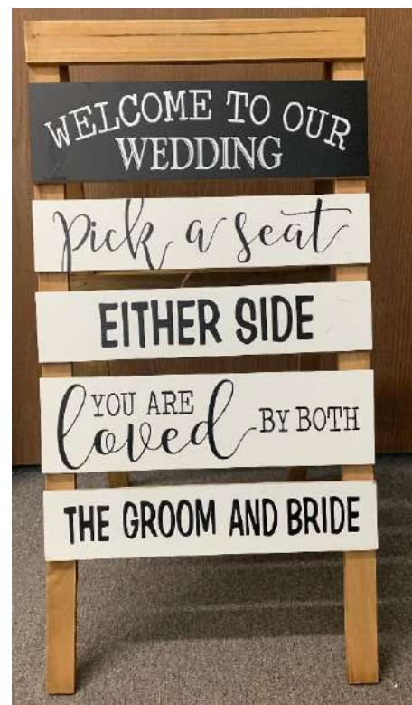
Black and White Sign- “Welcome to our wedding. Pick a seat either side, you are loved by both the groom and bride.”