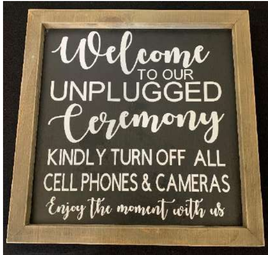
Small Chalkboard sign with Wooden Border- "Welcome to our unplugged ceremony. Kindly turn off all your cell phones and cameras. Enjoy the moment with us."