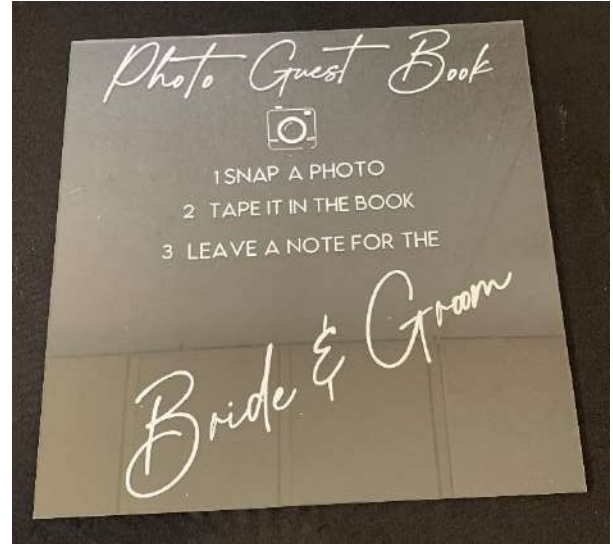
Acrylic Sign- Photo Guest Book