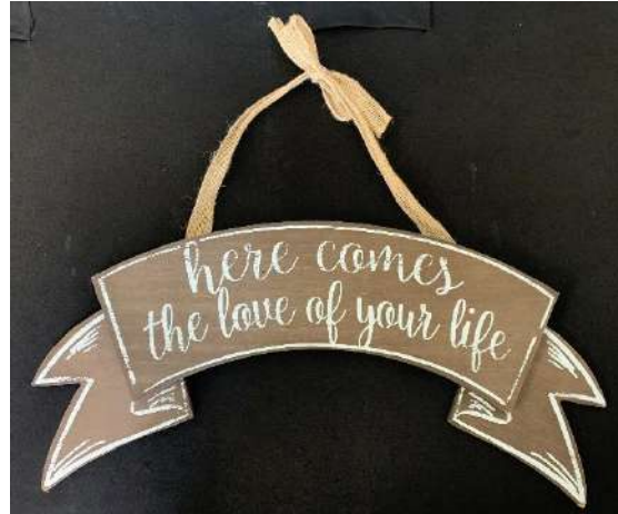
Carrying Sign- "Here comes the love of your life."