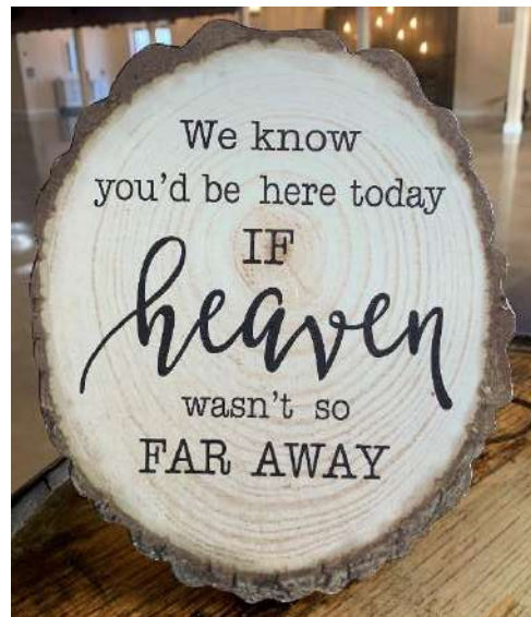
Small Oval, Wooden Sign- "We know you'd be here today if heaven wasn't so far away."