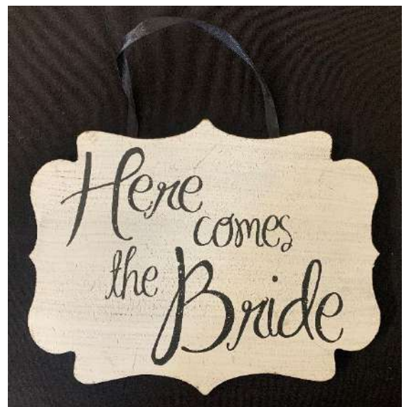
Small Carrying Sign- "Here Comes the Bride."