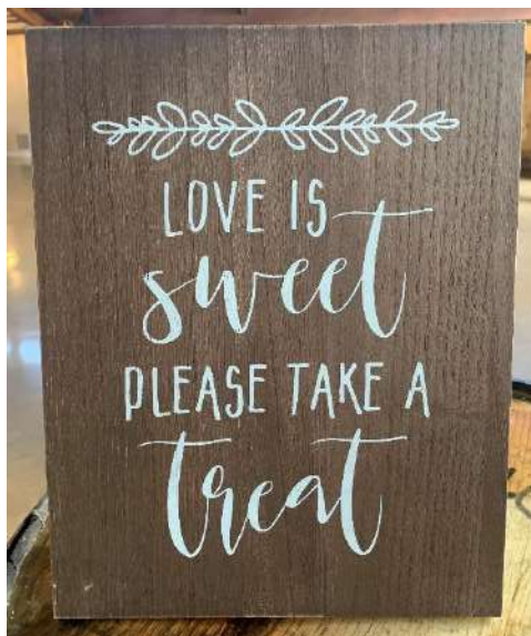
Wooden Sign with White Lettering- "Love is Sweet Take a Treat."