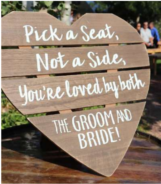
Wooden, Heart Shaped Sign- "Pick a seat, not a side. You're loved by both the groom and bride!"