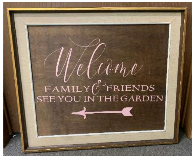
Wooden Sign with Gold Framing- "Welcome Friends & Family, See you in the garden."