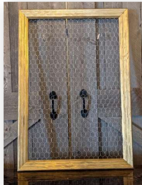
Gold Frame with Chicken Wire