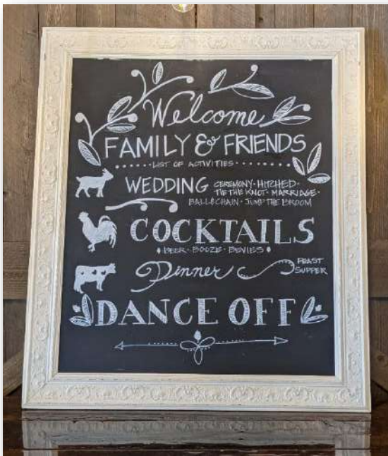
Large Chalkboard Sign with White Framing- "Welcome Friends & Family. List of Activities"