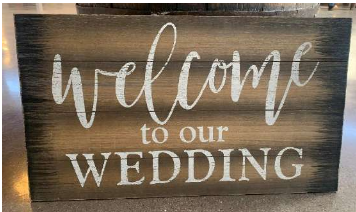
Wooden Sign with White Lettering- "Welcome to Our Wedding"