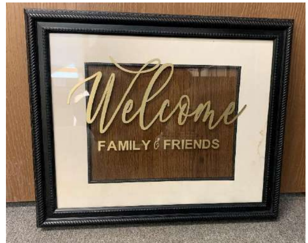
Framed Welcome Friends & Family Sign with Gold Lettering