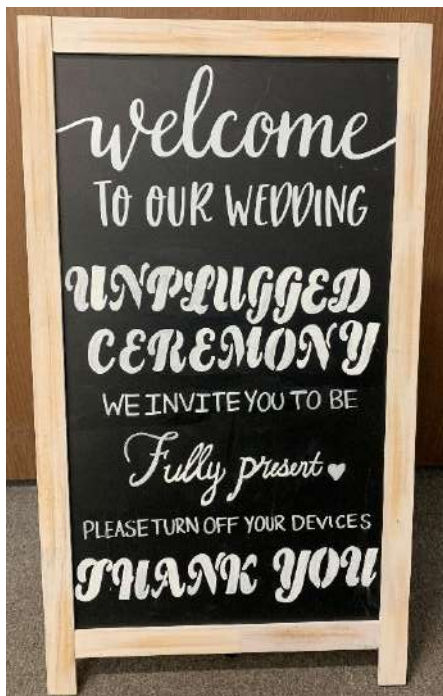
Chalkboard Sign with Wooden Border- “Welcome to our wedding. Unplugged Ceremony. We invite you to be fully present. Please turn off your devices. Thank you.”