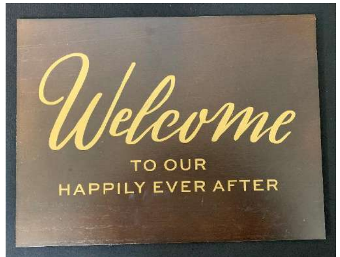
Wooden Sign with Gold Lettering- "Welcome to Our Happily Ever After."