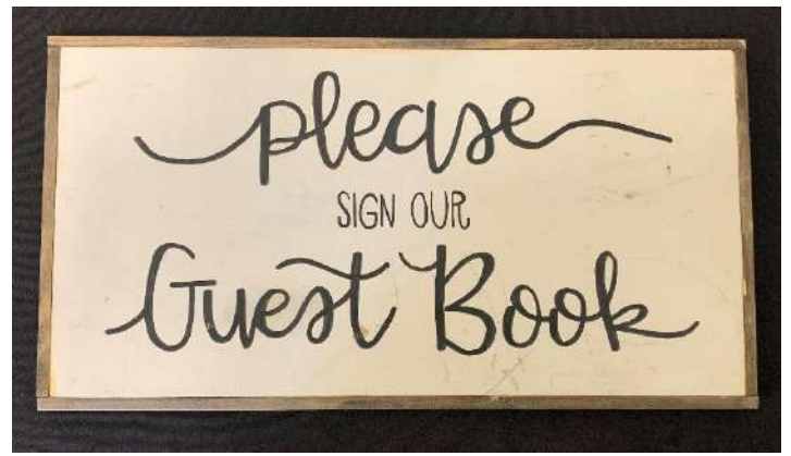
Please Sign Our Guest Book