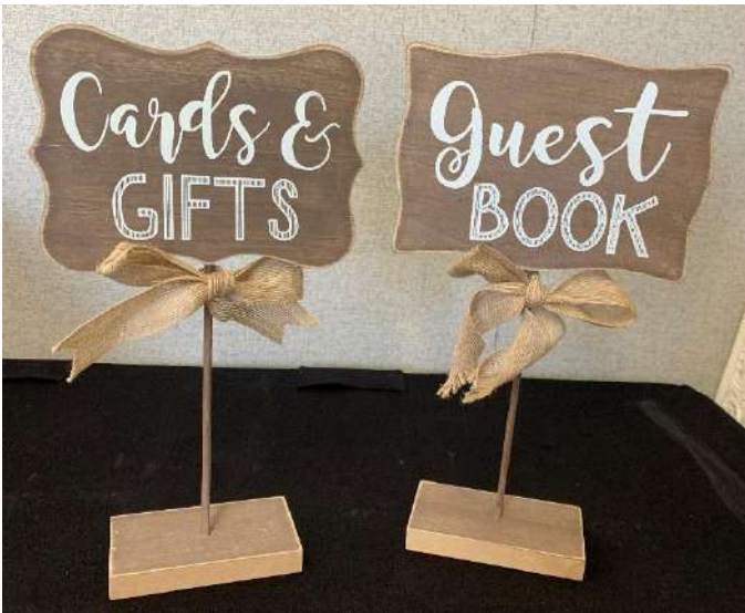
Tall Wooden Signs- Cards & Gifts, Guest Book