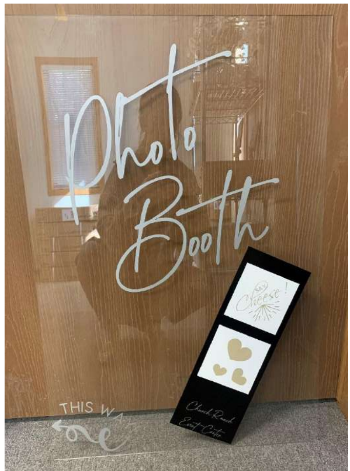
Acrylic Sign- “Photo Booth this way”