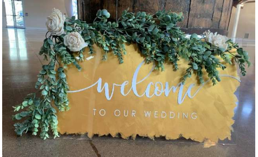
An Acrylic Sign with a Gold Background and Greenery Along the Border- "Welcome to Our Wedding."