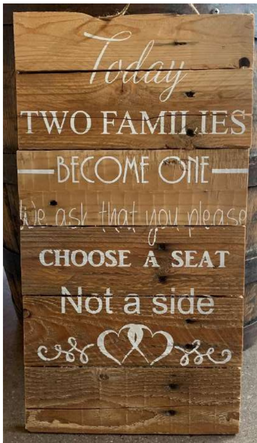
Wooden Sign with White Lettering- “Today two families become one. We ask that you please choose a seat not a side”