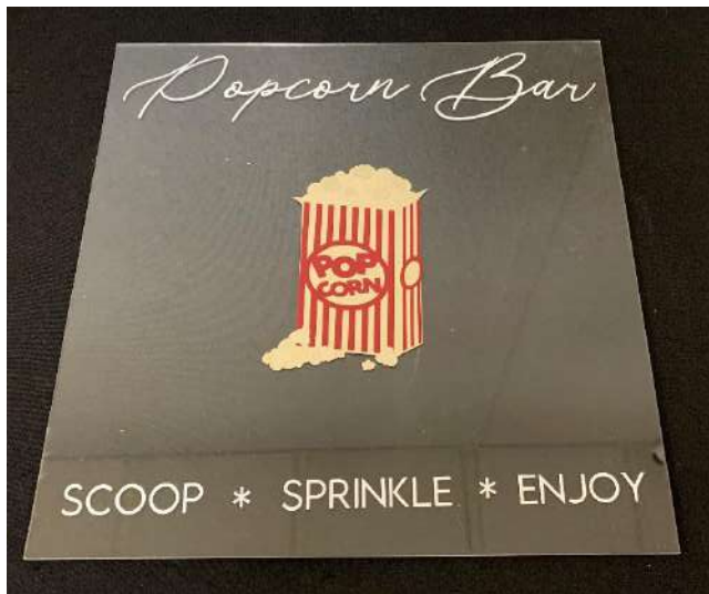
Acrylic Sign- Popcorn Bar