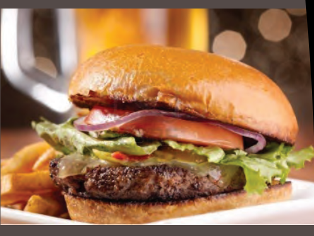
Bacon & Swiss Burger

6oz Homemade, breaded chicken breast stuffed with ham & Swiss cheese, topped with homemade gravy. $15.99