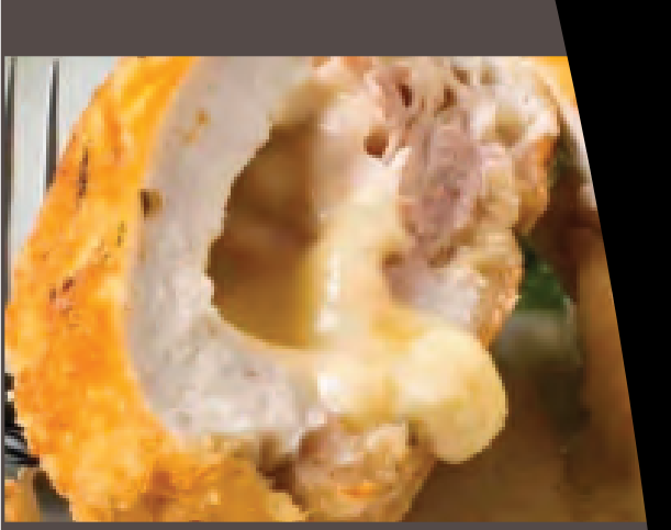
Chicken Cordon Bleu

6oz Homemade, breaded chicken breast stuffed with ham & Swiss cheese, topped with homemade gravy. $15.99