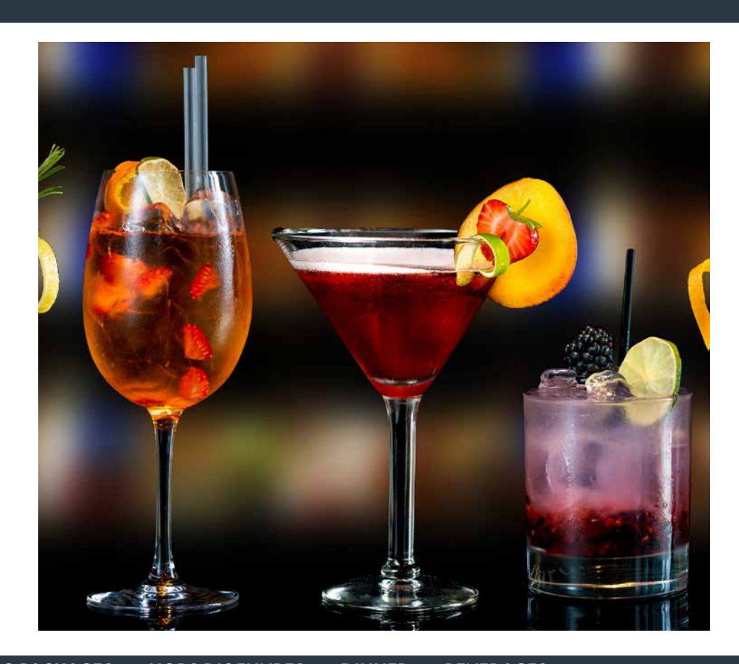
TABLE OF CONTENTS • AMENITIES • SPACES • WEDDING PACKAGES • HORS D'OEUVRES • DINNER • BEVERAGES

Please note that most special requests can be accommodated with advance notice. Don't hesitate to ask about specialty beer, wine or liquor.