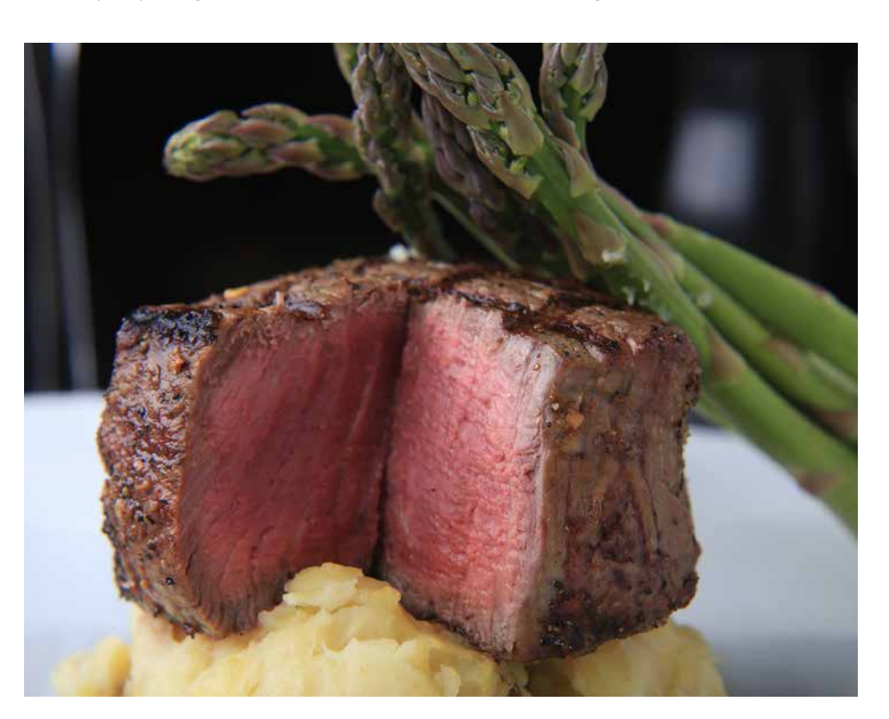
TABLE OF CONTENTS • AMENITIES • SPACES • WEDDING PACKAGES • HORS D'OEUVRES • DINNER • BEVERAGES