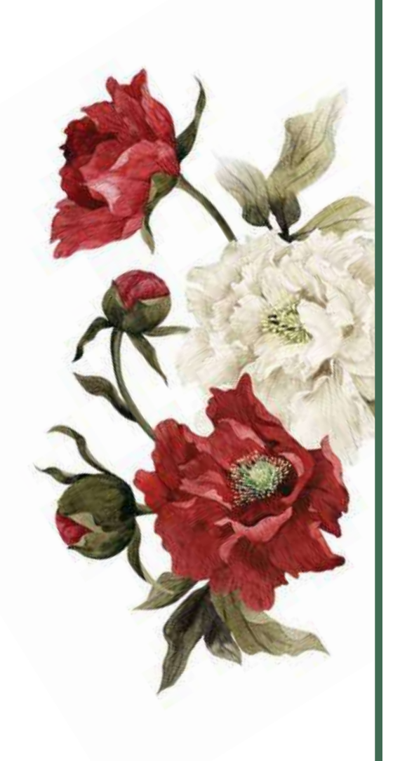
$1,500 per couple

Meals and Rooms Available for your Guests for an Additional Charge