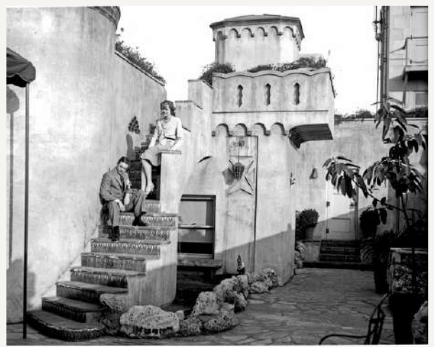
Oviatt Penthouse Rooftop Garden - 1928