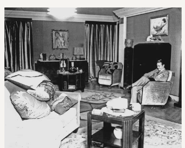
Oviatt Penthouse Living Room - 1928