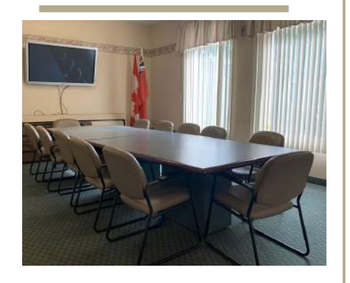
Holds up to 12 guests. TV & HDMI cord available.