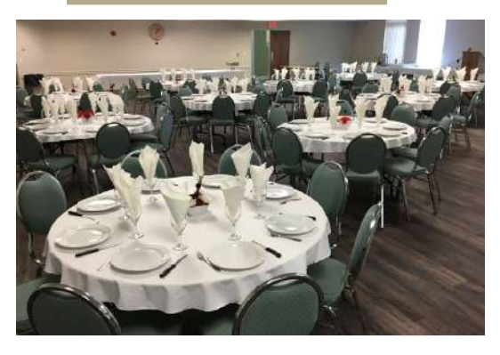
Holds up to 200 guests. Mic, sound system and projector available upon request.