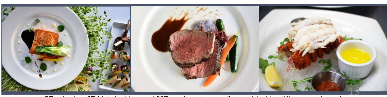
7% sales tax, 2% historical fee and 20% service charge will be added to all items purchased

Short Rib fork tender boneless, braising liquid mashed potato is preferred starch $34