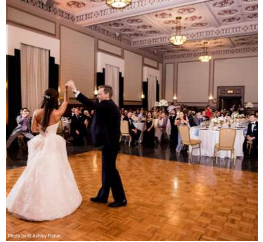
Ballroom Reception: 225 Max Seated Capacity