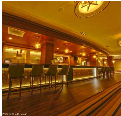
Budweiser Kiel Club Cocktail Reception