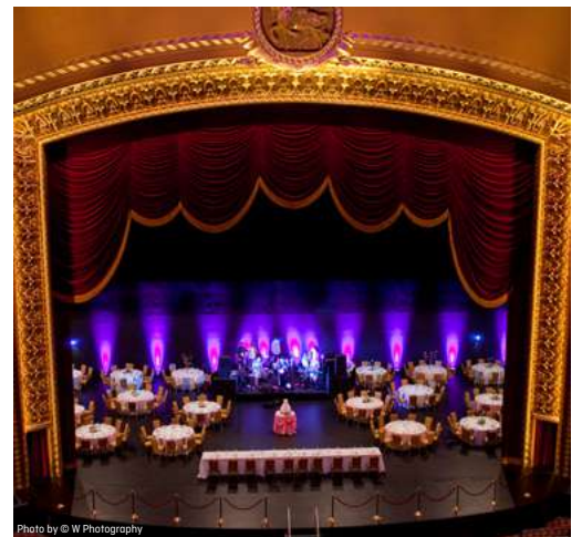
Grand Theatre Reception: 300 Max Seated Capacity