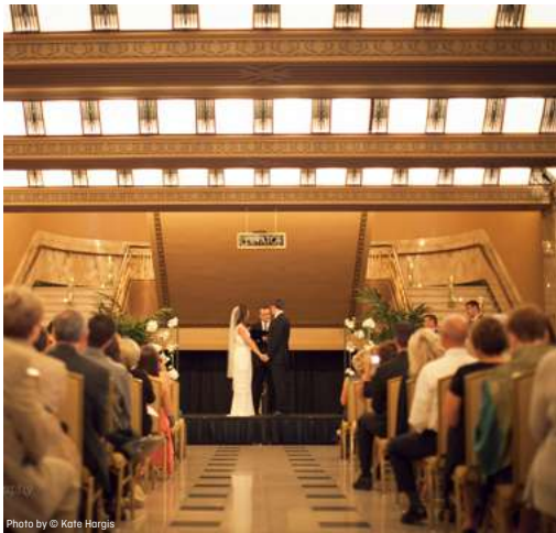
Ticket Lobby Ceremony: 300 Max Seated Capacity