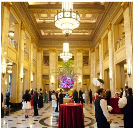
Grand Lobby Cocktail Reception