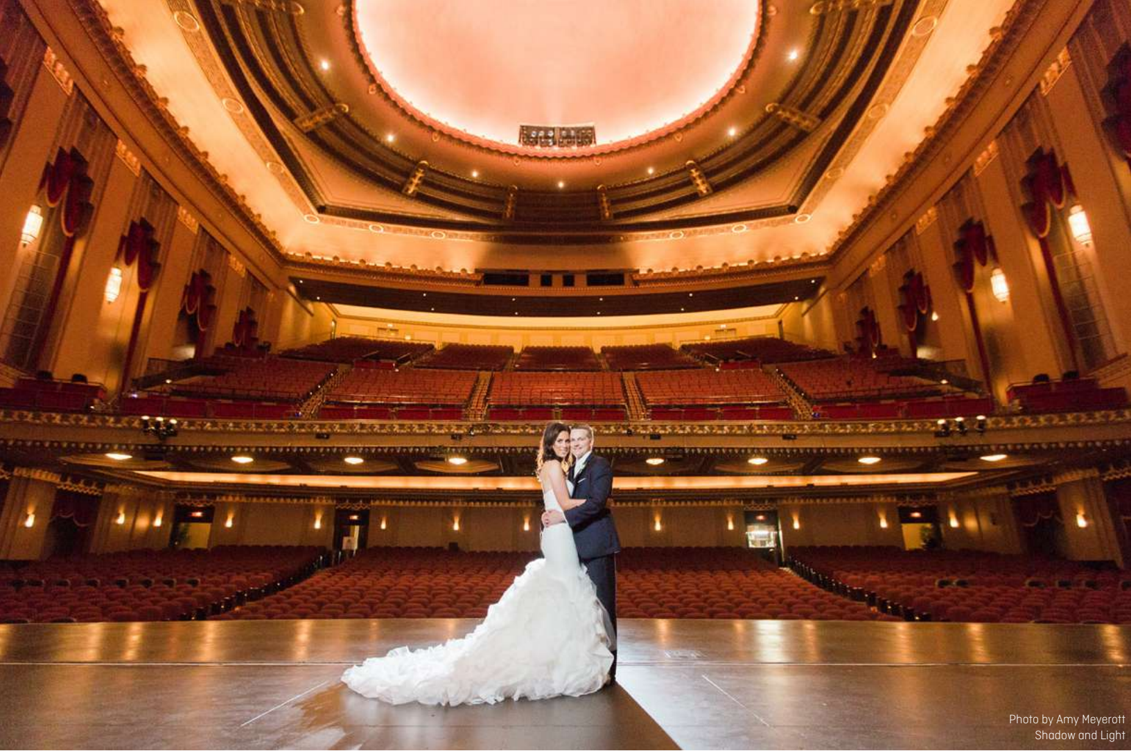
Shadow and Light