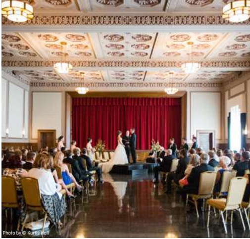
Ballroom Ceremony: 225 Max Seated Capacity