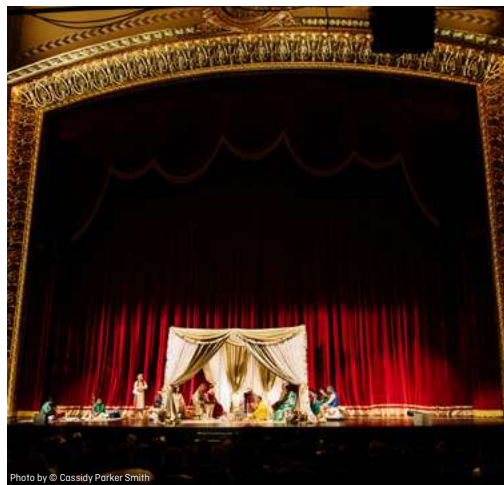
Main Theatre Ceremony: 300 Max Seated Capacity