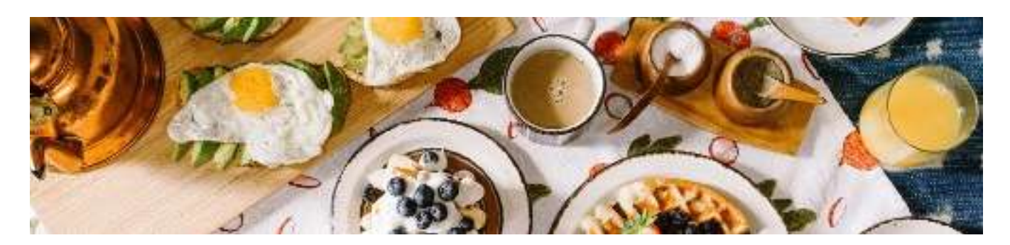
**An additional 11% tax and 22% service charge is added to all F&B**

Chef's Selection of Cakes, Pies, Tarts, Candies, Cookies and Confections