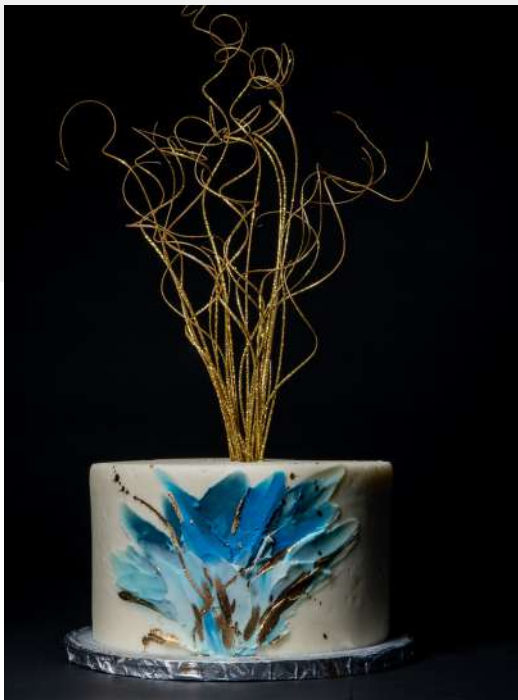
SPLASH (Cake topper not included)