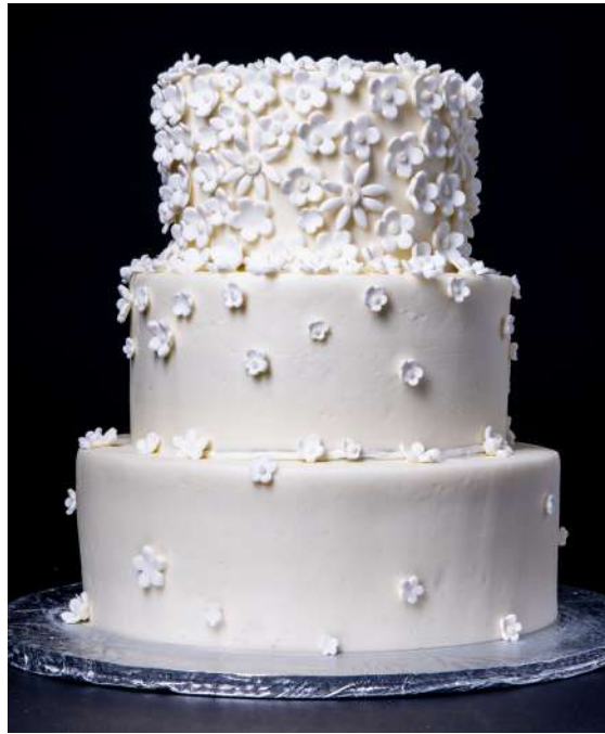
SPRING AND SUMMER FLORAL