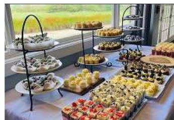
Cymz Sweet Kre8tionz

*Consuming raw or undercooked meats, poultry, seafood, shellfish, or eggs may increase your risk of foodborne illness, especially if you have certain medical conditions.