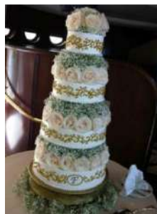
Maui Wedding Cakes