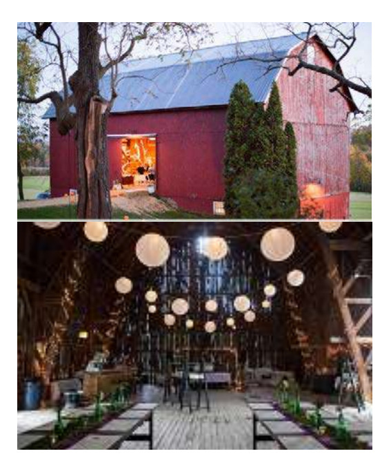
Decked out for the festivities