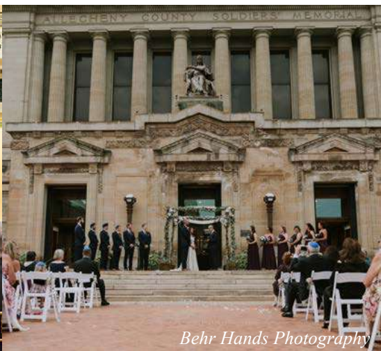
Behr Hands Photography