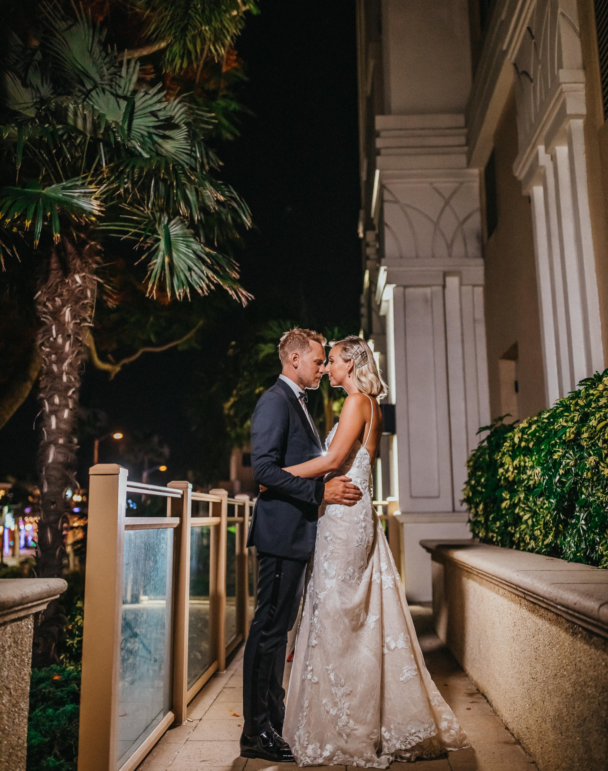
Rad Red Photography