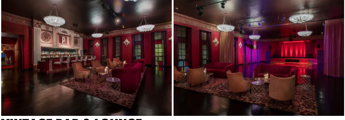
VINTAGE BAR & LOUNGE