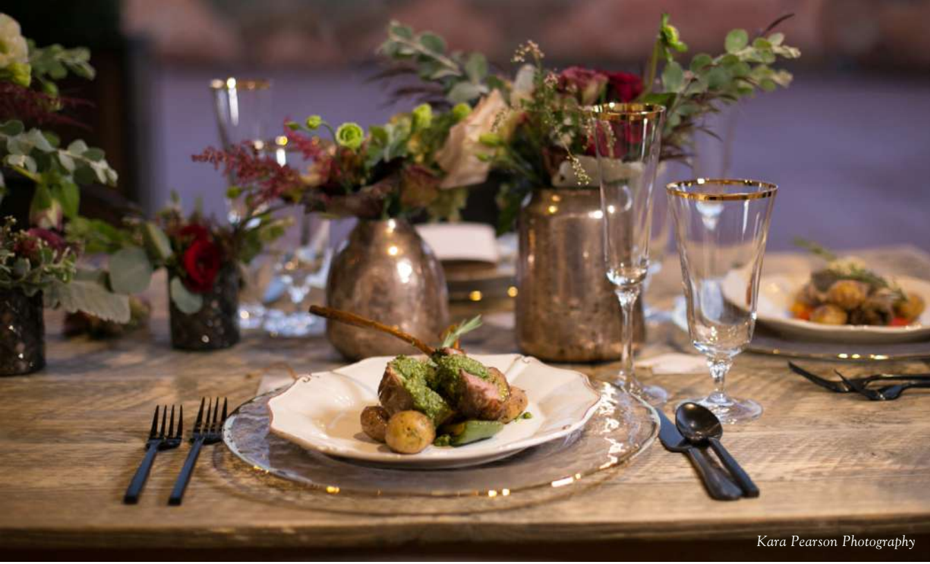
Kara Pearson Photography