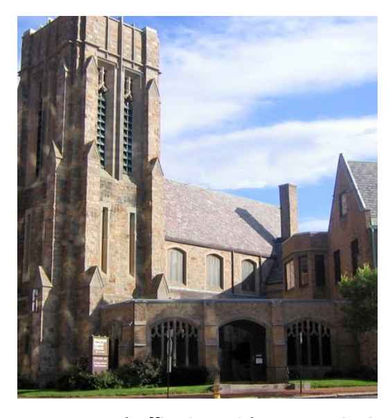
An Open and Affirming Faith Community in Portland, Maine