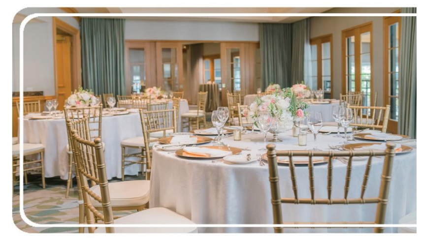
*additional rental fee may apply