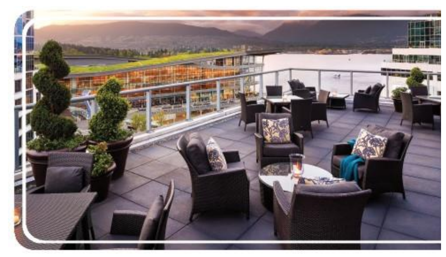
*additional rental fee may apply