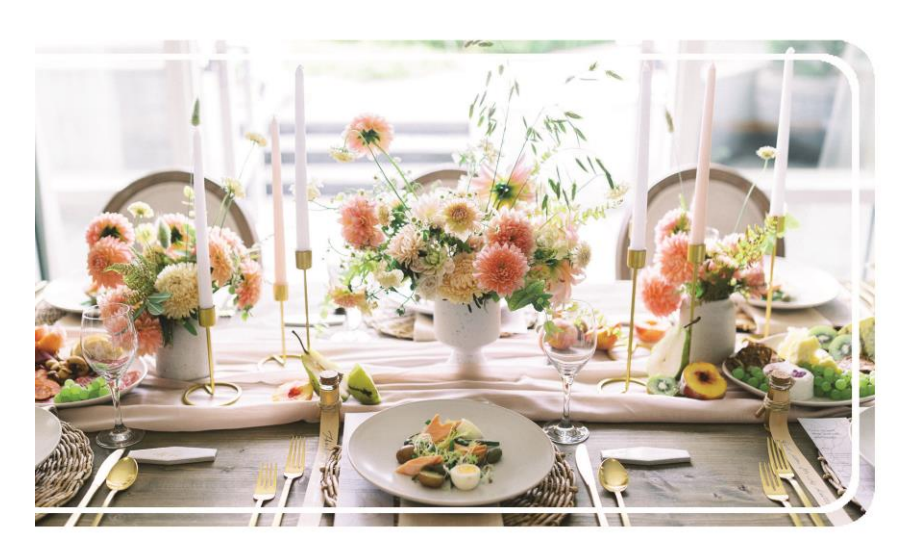
*additional rental fee may apply