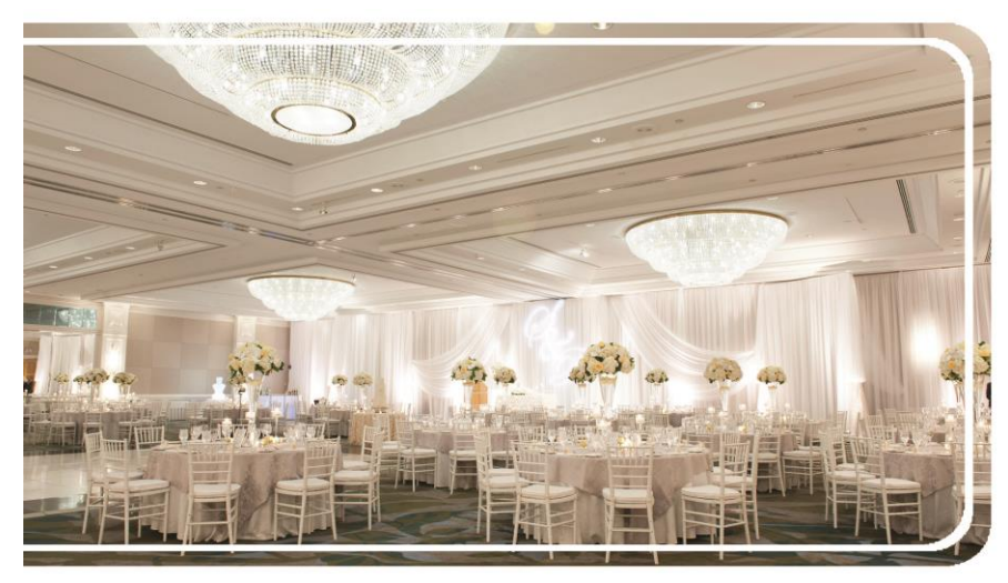
*additional rental fee may apply