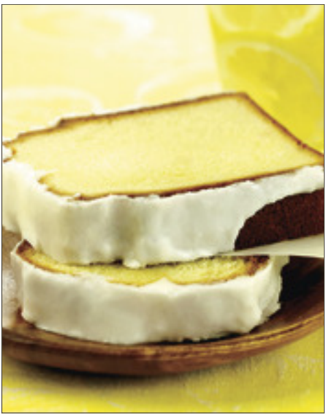
All Day Beverage Service

Coffee, iced tea, assorted Pepsi products 8.95