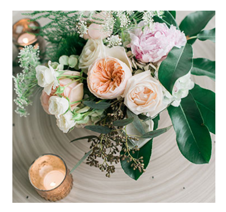
PHOTOGRAPHERS Featured Casey Rose Photography

Madison Resavy 919-428-7715 Ashley Cakes 919-649-0404 Duck Donuts 919-468-8722 Once in a Blue Moon 919-319-6554 Simply Cakes 919-460-9110