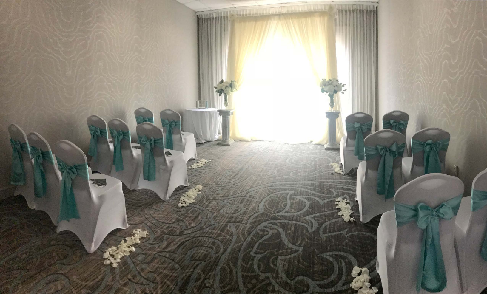
VAN GOGH ROOM Accommodates up to 20 guests. Location: Inn