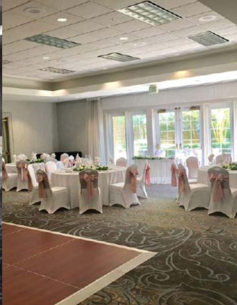
NICE AND CANNES BALLROOM Each can Accommodates up to 50 guests. Location: Inn