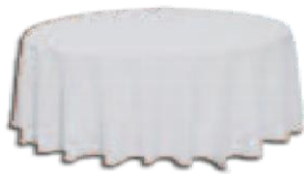
Full Length Table Linen