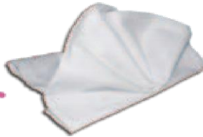
Classic Linen Napkin