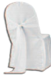
Classic Linen Chair Cover