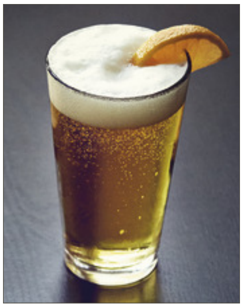
Eat, Drink & Connect

Two hours Choice of 5 appetizers 1/2 priced drinks $10.95